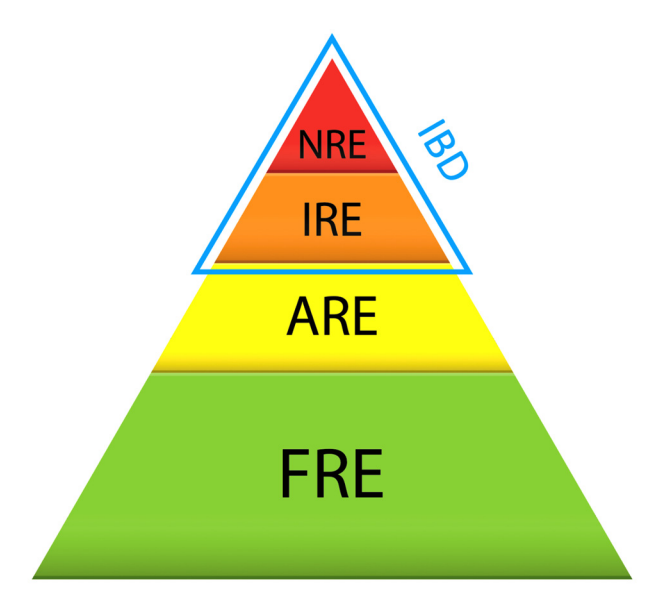
Figure 1. Representation of the "old" classification of canine chronic inflammatory enteropathies. FRE: food-responsive enteropathy, ARE: antibiotic-responsive enteropathy, IRE: immunosuppressantresponsive enteropathy, NRE: non-responsive enteropathy and IBD: inflammatory bowel disease if mucosal inflammation is demonstrated. Reprinted with permission from Ref. [1]. Copyright 2016 British Small Animal Veterinary Association.

To date, no pathognomonic clinicals signs or clear scoring values have been determined to discriminate CIE categories.