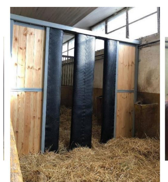
Figure 1: Pictures of the social box: empty (on the left) and during a social interaction (on the right)