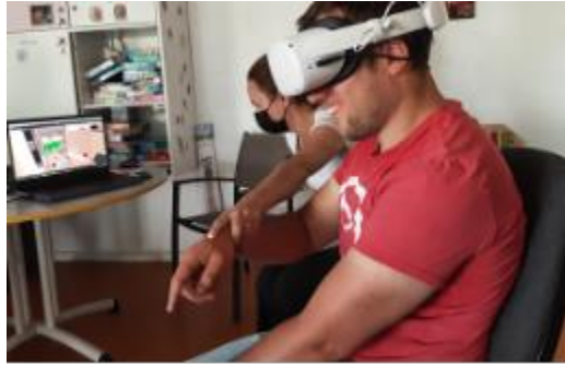
Figure 1: Experimental setup including external screen and third-party guide.