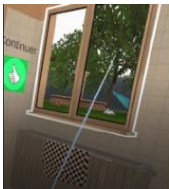
Figure 4: The sensory resting space, a window to a peaceful outer world.