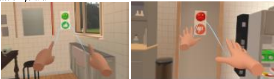
Figure 3: The pictogram system used to collect the effective agreement of the participants.

First of all, it is the autistic participant who makes the choice of the third party who will accompany him or her. It is then the responsibility of this "third-party guide" to verify the effective agreement of the participant, before and during the immersive trial. In order to overcome the subjects' communication deficits, a pictogram system (Figure 3) was designed and implemented in the VR environment. These are presented to them before the VR session. Participants are free to point to any of the pictograms at any time during the experiment or after the actual request of the guide to continue or not. Because some people with autism suffer from echolalia or have great difficulty in reversing, the repetition of the request during the test is important.