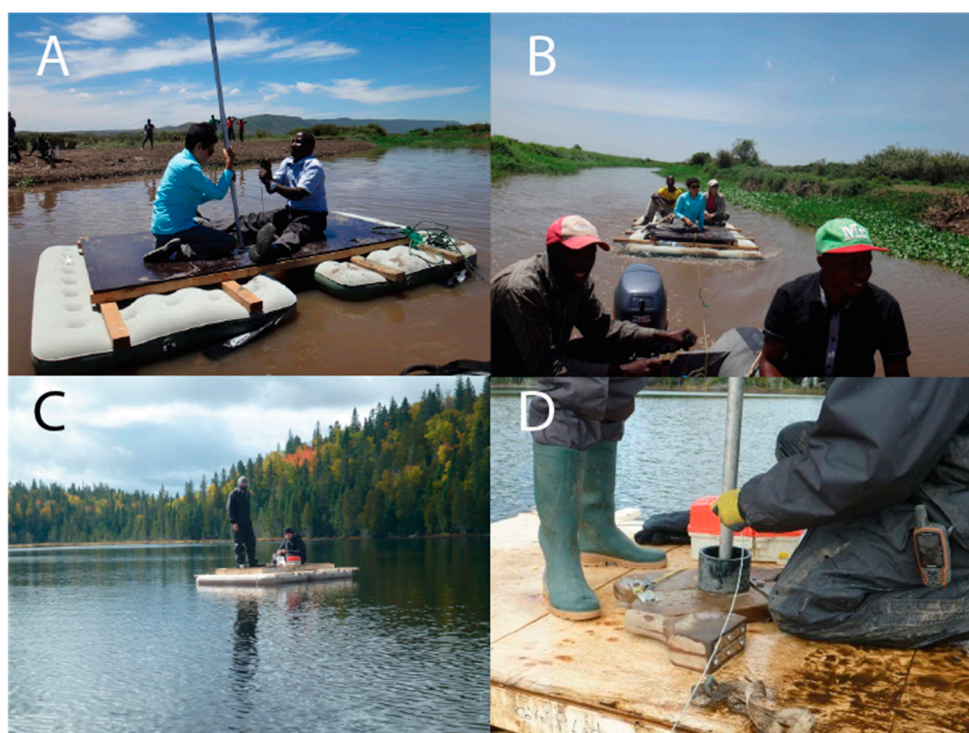
Figure 2. Examples of use of the LAST coring platform. Coring campaign of the Mara River in 2015 [18] using the LAST platform and a Russian corer (A, © Christopher Dutton). During this field campaign, the platform was towed by a boat between the several coring sites (B, © Christopher Dutton). The platform should be anchored at 3 points to achieve stability during the coring and when the water depth is too important (e.g., >4 m) a casing can be used, as shown in (C, © Olivier Blarquez) and (D, © Olivier Blarquez), respectively, during a coring campaign in boreal Canada.

The LAST coring platform has been tested in various situations and used to core 14 lakes and 2 rivers (Figure 2). The platform has been used in boreal Canada [16,17], in tropical Africa to core the Mara river [18], and to core two small shallow lakes in the Republic of Congo [14]. The LAST coring platform has been transported on foot, all-terrain vehicles, boat, helicopter, and pickup trucks. For example, the platform has been towed by a zodiac boat for more than 10 km along the Mara river in 2015. During all those field work campaigns, we never punctured any inflatable mattresses although we cored lakes with abundant shore vegetation. However, air mattresses are not engineered to standards used for inflatables intended for use as a flotation, and extra care should be taken when using air mattresses. In this respect, we advise users to wear life jackets at all times. In case of a puncture, the second mattress and the wood construction should enable the platform to remain afloat.