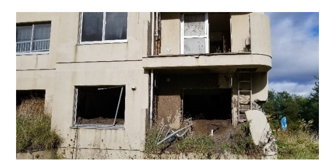
Figure 4. A residential building, swept by a mudslide near Toya Lake.

2000 spewing burning gases and mud. It was the mud slides that had the most impact on local towns, destroying whole roads and buildings on their path (Nakano). Although no one died, the damage incurred was estimated to be 10.3 billion yen (approx, 92 million US dollars), and 4700 inhabitant of nearby municipalities had to be evacuated (Figure 4).