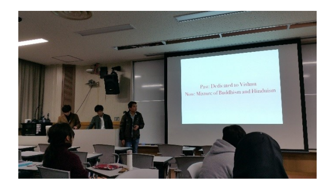
Figure 2. Students presenting some aspects of their cultural background in Hakodate.

deprtament for engineering innovation at NIT Tomakomai. The students, divided into groups, also had an opportuinity to reflect upon stereotypes, and how they influence communication.