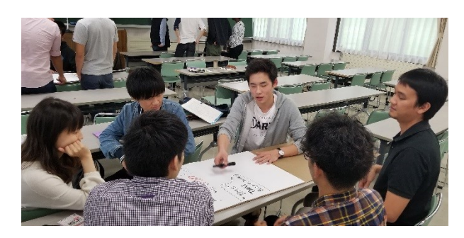
Figure 3. One of the groups brainstorming ideas for their poster session. 3 countries were represented in that group (Japan, Thailand, and Mongolia).

The second on-site seminar took place during a 3-day weekend in October 2018 in Otaki seminar, Date city, west of Tomakomai. The theme of that seminar was one that echoed with all students-Japanese and foreign-Disasters; their prevention, human causes, and effect they have on city planning and environment. 19 students from the following areas were represented: India, Indonesia, Japan, Malaysia, Mongolia, Thailand, Vietnam, each group being led by a PhD student from that country, who were studying at MIT. Although group discussions were conducted in Japanese and English, students had to focus on creating a presentation in English. The educational practice was two-fold: visiting a location that had been hit by a disaster near Toya Lake, and for students to use their engineering skills to discuss and reflect upon disaster prevention methods in the four countries (Figure 3).