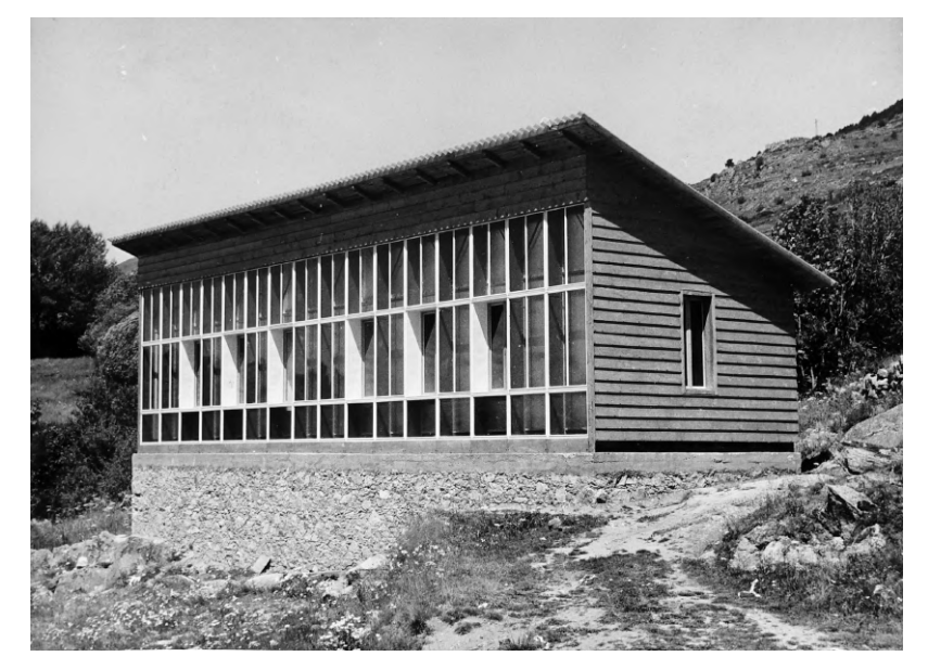
Fig.2. Experimental solar house, Odeillo, France, 1961-62 (Félix Trombe papers, private collection of Michèle Lhermitte).

Trombe's technoscientific project to use Sahara as a laboratory to initiate the deployment of solar energy had begun to realize.