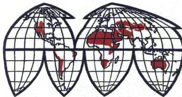
Fig.1. Arid Zone Program logo (UNESCO, 1956).

The United Nations Educational, Scientific and Cultural Organization (UNESCO) played a prominent role in this process. Willing to establish transnational scientific research projects, the UNESCO launched the Arid Zone Program at a symposium held in Algiers in 1951 (Batisse, 2005). As defined by experts of this program, the arid zone was composed of regions that shared climatic analogies: few annual precipitations and episodes of extreme temperatures (Fig.1). It comprised regions of Central Asia, Australia, West America, the Middle East, Southern Africa, and, notably, the whole northern part of the African continent, with, at its core, Sahara (UNESCO, 1952). Life faces serious difficulties to develop in such territories, and modern science, together with a rational use of technology, was seen as a major lever to improve possibilities of inhabiting, cultivating, and exploiting natural resources in the deserts. In the course of the 1950s, the UNESCO thus organized a series of annual symposiums and financed programs in order to stimulate scientific research and international cooperation on all aspects concerning the arid zone.