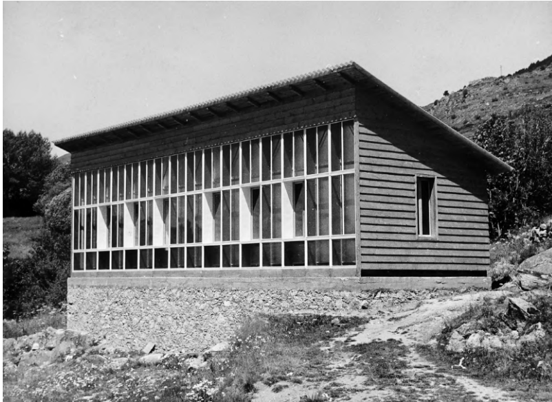
Fig.2. Experimental solar house, Odeillo, France, 1961-62 (Félix Trombe papers, private collection of Michèle Lhermitte).

Trombe's technoscientific project to use Sahara as a laboratory to initiate the deployment of solar energy had begun to realize.