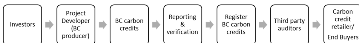
Figure 2. Streamlined representation of pivotal actors within the voluntary BC value chain in market dynamics.

Participation in the Carbonfuture [82] marketplace requires that both the biochar and its production process adhere to the certification standards outlined by the European Biochar Certificate (EBC) or an equivalent certification body [39]. Similarly, Puro Earth also mandates that the production process be certified by the EBC or a comparable certification entity [83]. However, in cases where the production process lacks certification, an official life cycle assessment needs to be executed and presented [43]. Essentially, most of the prerequisites for participating in the Puro marketplace align with the requirements of the EBC. Additionally, an independent facility audit (Figure 2) may be required as an additional step.