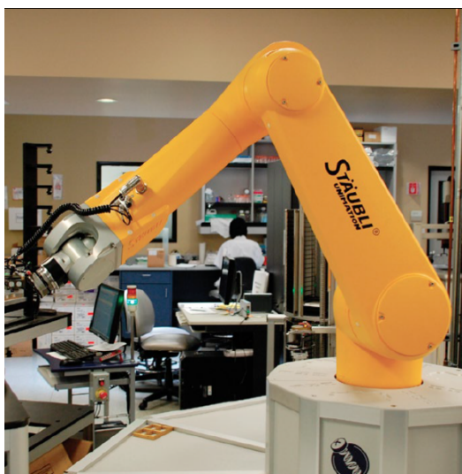
Figure 2. Source : NTP, 2017, Tox21: Chemical testing in the 21st century.

Under the impetus of the chief of the US National Toxicology Program, Chris Portier (a biostatistician who had, among other things, worked in the area of PBPK and BBDR), a draft of strategy was elaborated around 2003 « to move toxicology to a predominantly predictive science focused upon a broad inclusion of target-specific, mechanism-based, biological observations ». The Environmental Protection Agency embarked on a similar effort a few years later. Teaming up, these institutions soon developed a vast, multi-institutional multi-annual effort known as Tox21, to conduct hundreds of assays on thousands of substances, thanks to high-throughput technologies. The central character in this program, which took off in 2008, is a robot from the swiss company Stäubli, of the sort that one generally encounters in industrial plants. The robot is programmed to be able to manipulate plates containing dozens of mini-petri-dishes, in which different dosages of multiple chemicals are injected, day after day, and multiple assays conducted.