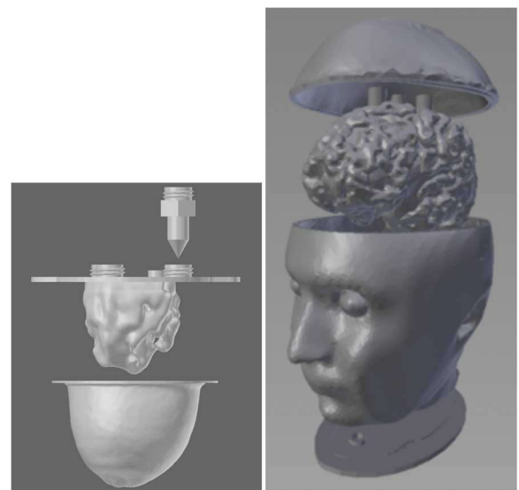
Fig. 3 GeePs-L2S Breast and Head STL files

The GeePs-L2S breast and head phantoms are described in detail in the paper [1]. Their structures were designed to be 3D-printed and filled with mixtures that dielectrically mimic tissues and the recipes for which are given on the website. The original files come from the University of Wisconsin-Madison [14], and the Athinoula A. Martinos Center for Biomedical Imaging at Massachusetts General Hospital [15] respectively. Figure 3 displays the views of the two phantoms. The breast phantom is composed of three cavities corresponding to adipose tissue, glandular tissue, and the tumor. The latter can be placed in three different locations thanks to a plate made up of three holes. There are two locations in the fatty cavity and one in the glandular part. The head phantom is made of four parts: the skullcap, the brain with or without stroke, the head, and the plate. The thickness of the structure corresponding to the head is 8 mm for good rigidity, while most of the other walls is 1.5 mm.