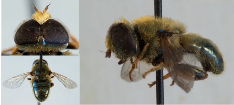
Figure 6. doi

Among the added species noteworthy is the oldest record of Merodon legionensis (Fig. 6) for France (Louboutin and Speight 2021).