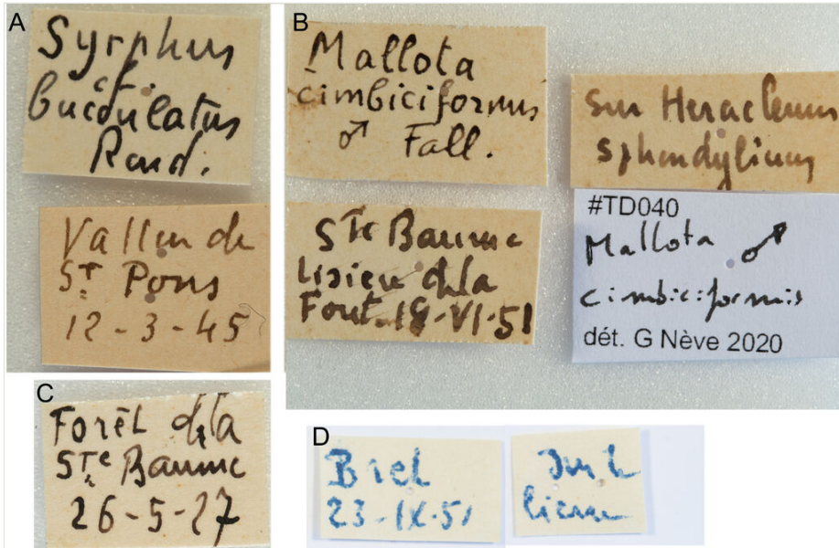
Figure 3. doi

scientificName. In three cases, the identification was only possible within a pair of species and the two species were mentioned in identificationRemarks: Microdon mutabilis or Microdon myrmicae (Schönrogge et al. 2002), Merodon moenium or Merodon avidus (Speight and Langlois 2020) and Cheilosia albitarsis or Cheilosia ranunculi (Doczkal 2000).