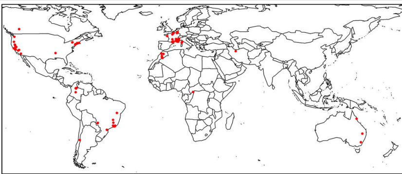
Figure 4. doi

World distribution of hoverfly specimens in the collection of Jean Timon-David.