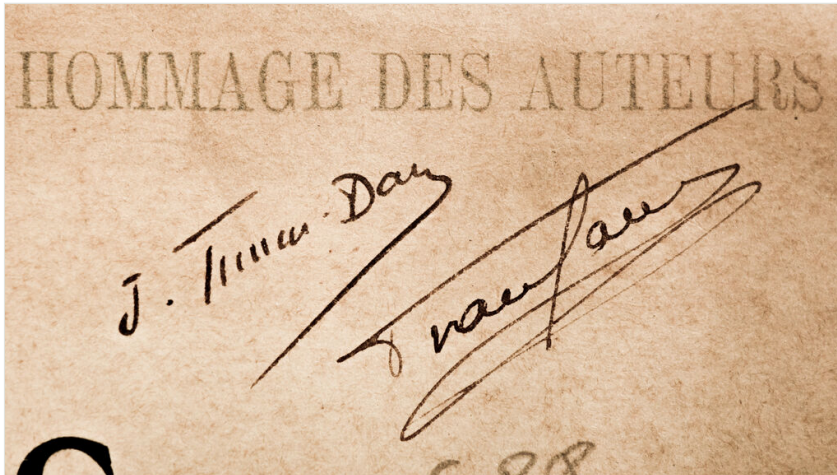
Figure 2. doi

We also want to raise awareness of the entomological work of Jean Timon-David, whose publications, in French, were often in regional journals or conference proceedings and, therefore, difficult to access. In their recent synthesis of the Syrphid fauna of France, Speight et al. (2018) cite only one of Timon-David's publications, that of 1937 which contains the original description of Cheilosia vangaveri (Timon-David, 1937), named in honour of Ferdinand Van Gaver (1874-1943), the only colleague with whom Timon-David published on Syrphidae (Van Gaver and Timon-David 1928, Van Gaver and Timon-David 1929a, Van Gaver and Timon-David 1929b). A signed reprint of one of their joint publications (Van Gaver and Timon-David 1937) was given to the University Library (Fig. 2).