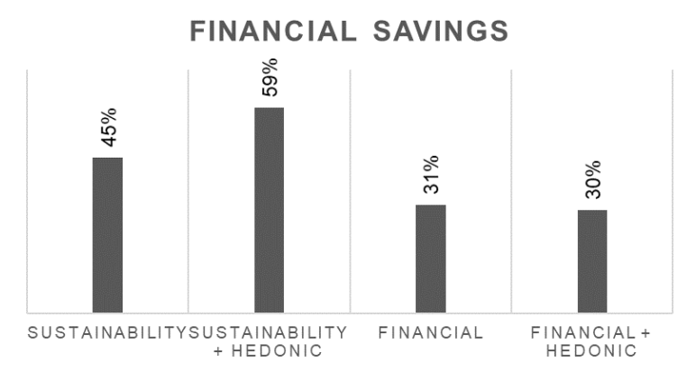
Figure 2. Average financial savings and room cleaning profitability index per intervention

To calculate the room cleaning profitability index, we multiplied the financial savings (in %) by the sustainability rating (on a scale of 1-10) and guest satisfaction scores (on a scale of 1-10). As an example, for the sustainability-hedonic condition, we obtained an index score of 32 = .0591 (savings) x 7.37 (sustainability rating) x 7.29 (guest satisfaction). As can be seen in Figure 2 (lower panel), the advantage of the sustainability-hedonic appeals over the other interventions even increases when taking the guest satisfaction and their rating of the hotel's pro-environmental actions into account.