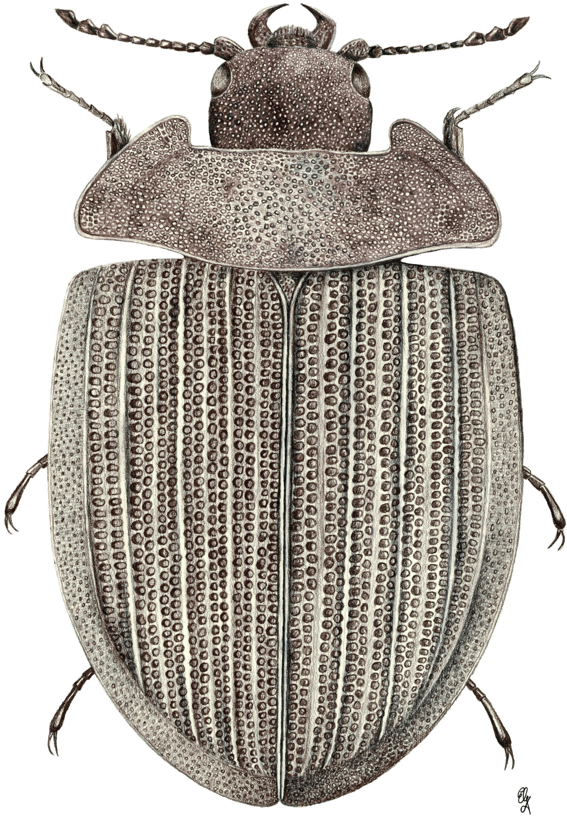
Fig. 3 Peltis antehercynica sp. nov. Reconstruction of the dorsal habitus