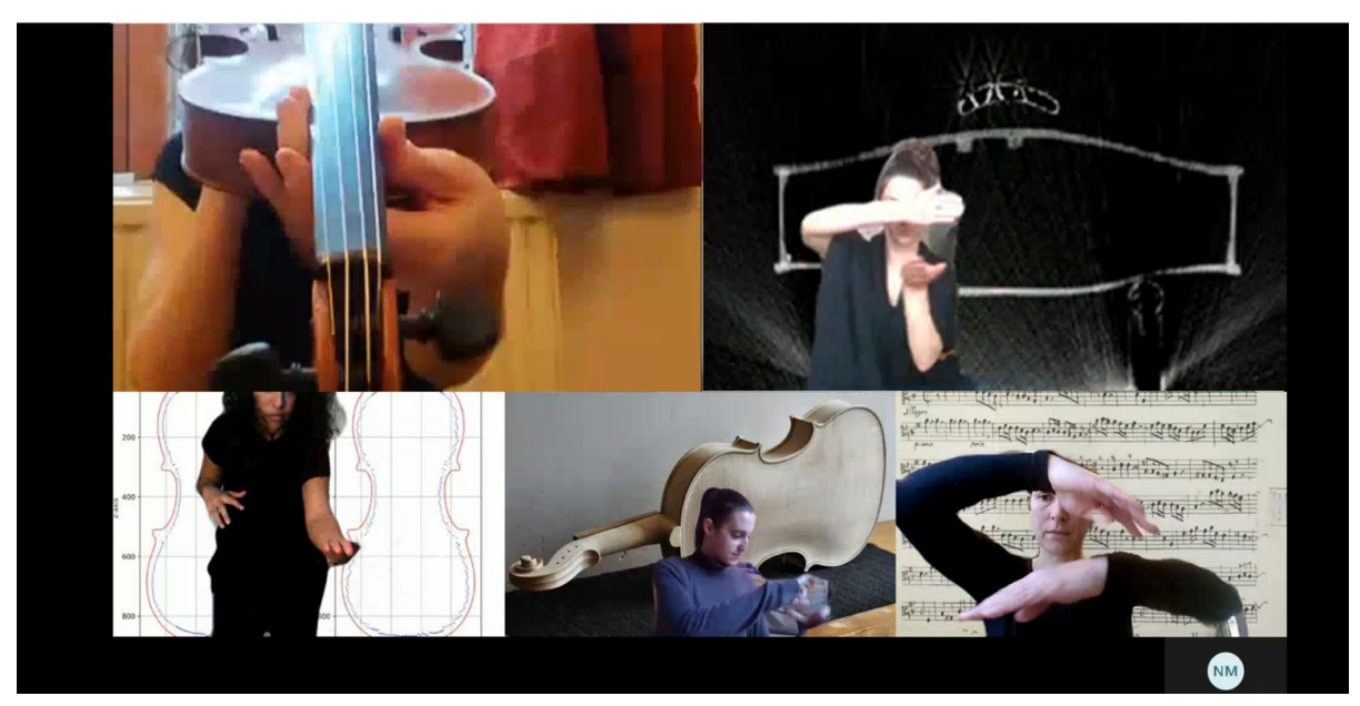
Figure 2 Dancing Experimentation Using Teams Background

and mitigate its limitations, in September 2022 the second "Dance your Ph.D. @ UCLouvain" workshop was organized using a blended/hybrid teaching method (See Table 2).