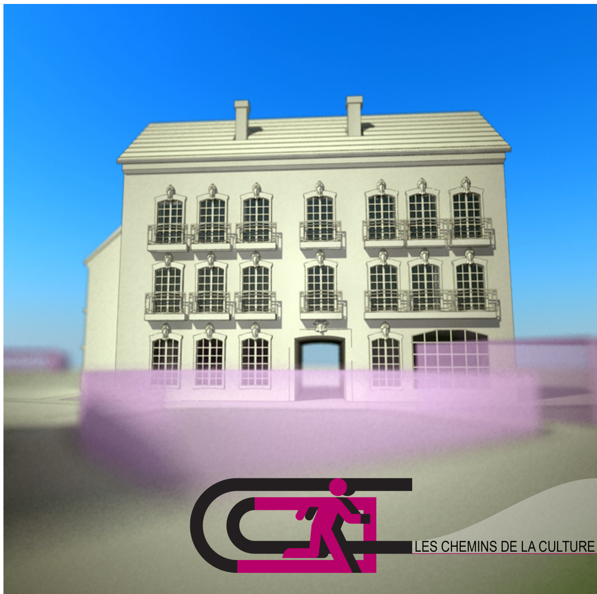
Figure 01. 3D Visualisation, Direction des Affaires Culturelles of Bourg-en-Bresse.

Keywords : Landscape, Hypermedia, Garden, Bourg-en-Bresse.