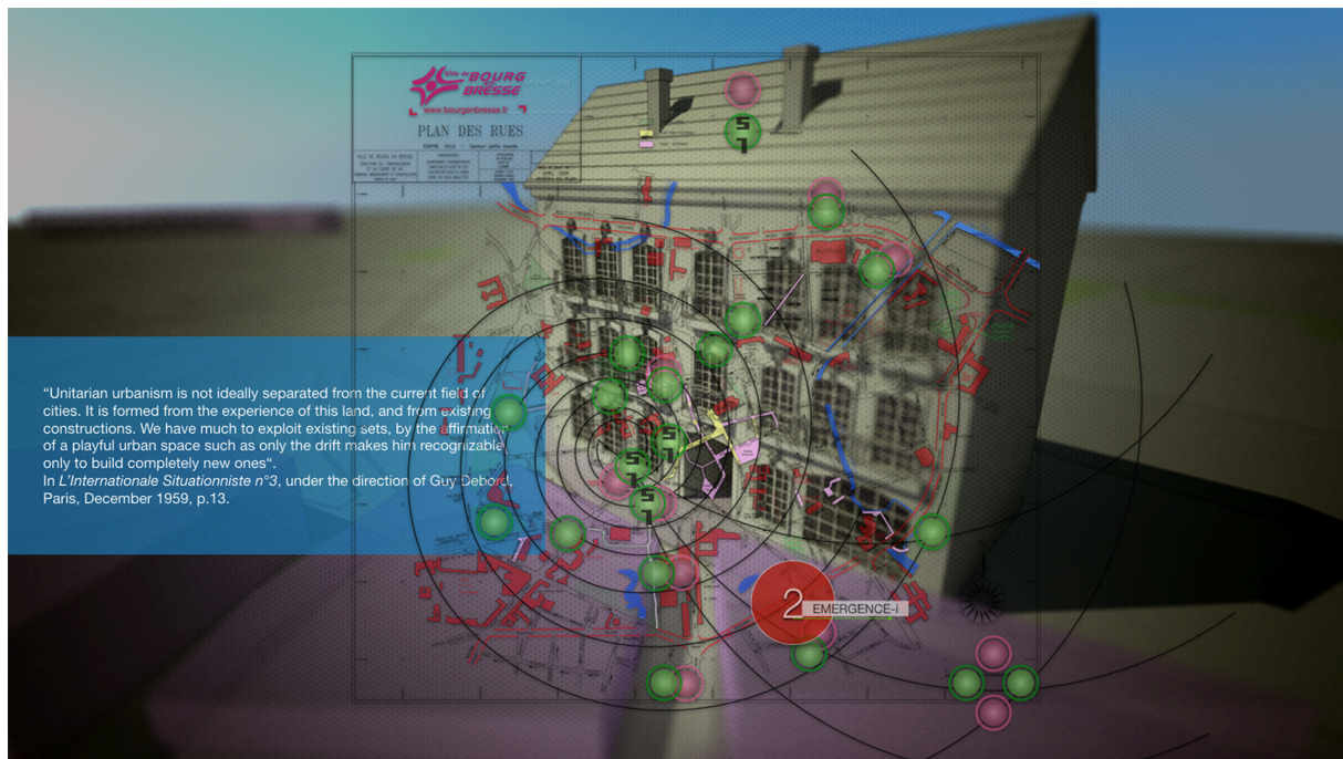
Figure 02. 3D Visualisation, Direction des Affaires Culturelles and Map of Bourg-en-Bresse https://www.youtube.com/watch?v=dX1iyb16A