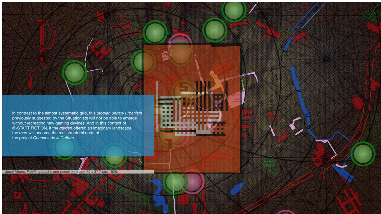
Figure 03. Chemins de la Culture links

paths of cultures. Unfortunately this mapping requires new contingencies, choices and political decisions.