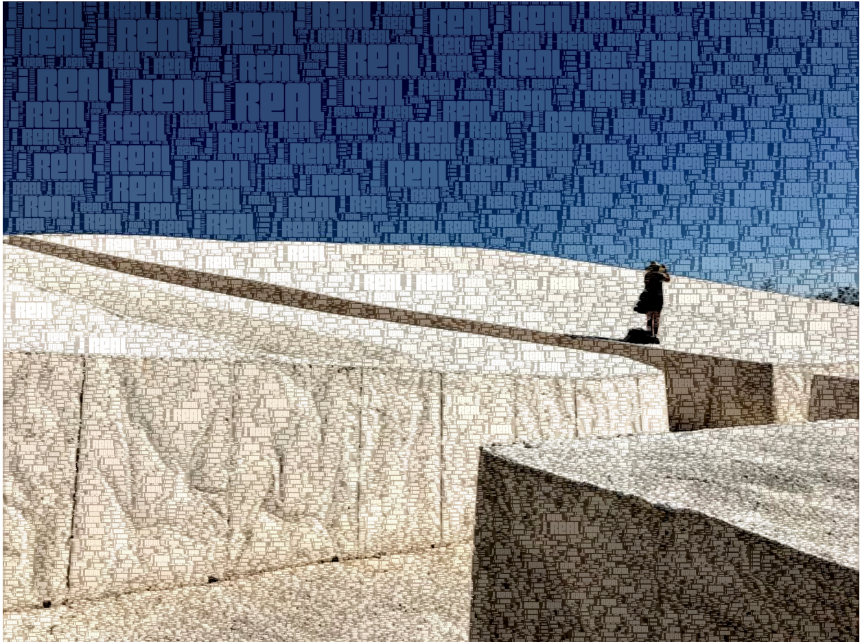
Alberto Burri, Cretto di Burri, Gibellina