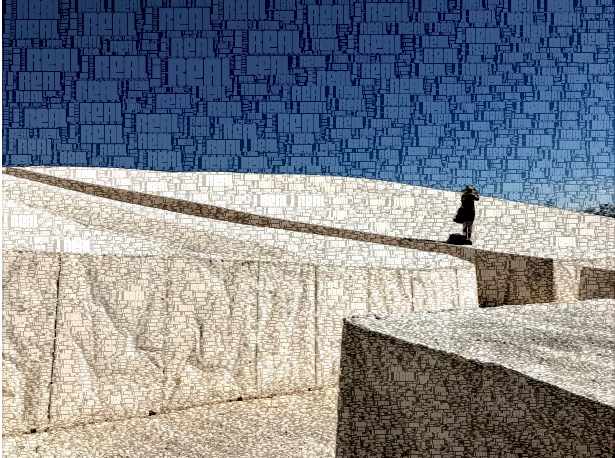
Alberto Burri, Cretto di Burri, Gibellina