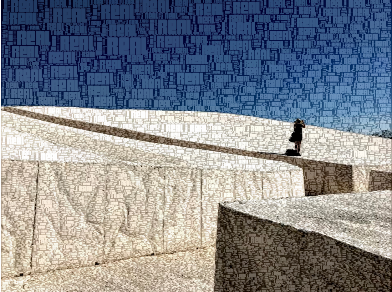
Alberto Burri, Cretto di Burri, Gibellina