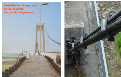
Monitoring of Tancarville and Iseron bridges