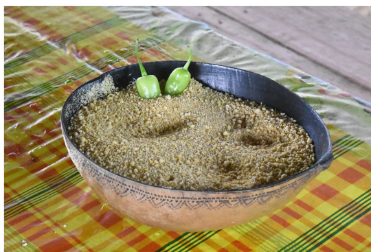
FIGURE 3 Torrefied semolina made from bitter cassava tubers, called kwak in French Guianese Creole and puveye in Parikwaki, served with hot peppers, or atit .