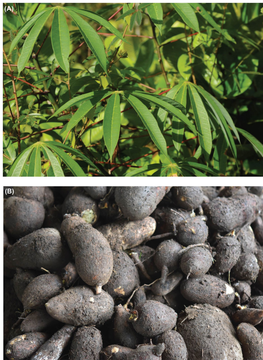
FIGURE 2 (A) Aerial parts and (B) tubers of bitter cassava ( Manihot esculenta ).

provided support for the distinction of high and low glycemic indices (GIs) of food in providing nutritional and dietary recommendations. Examples of food items with a high GI include those with a high starch content derived from grains like wheat ( Triticum aestivum L.; Poaceae) and rice ( Oryza sativa L.; Poaceae), as well as root vegetables like potatoes ( Solanum tuberosum L.; Solanaceae), yams ( Dioscorea spp.; Dioscoreaceae) and also cassava (39). According to the USDA (40), 100 g of raw cassava contains 60 g of water and 38 g total carbohydrate, which represents 12% of the daily value. Carbohydrates are therefore the main macronutrients and sources of energy followed by proteins (1.4 g), fat (0.3 g) and various micronutrients, like vitamins C and B6, and magnesium (40).