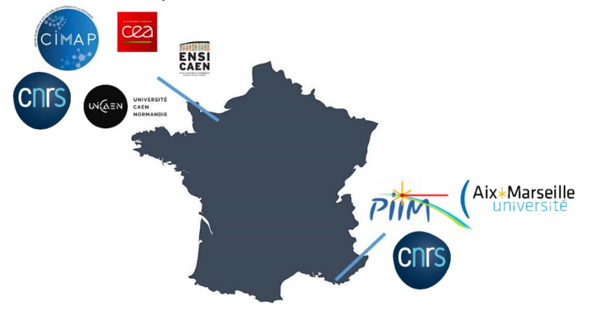
Figure 1. Partners involved in MIRRPLA: CIMAP (Centre de Recherche sur les Ions, les Materiaux et la Photonique, Caen, France) and laboratory PIIM (Physique des Interactions Ioniques et Moléculaires, Marseille, France).