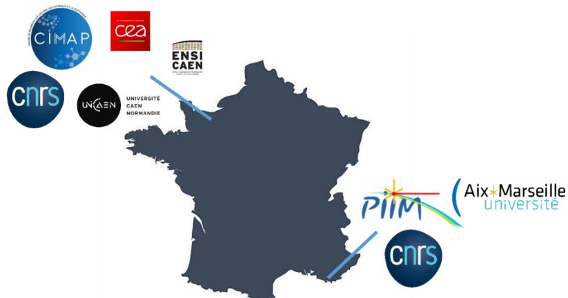
Figure 1. Partners involved in MIRRPLA: CIMAP (Centre de Recherche sur les Ions, les Matériaux et la Photonique, Caen, France) and laboratory PIIM (Physique des Interactions Ioniques et Moléculaires, Marseille, France).