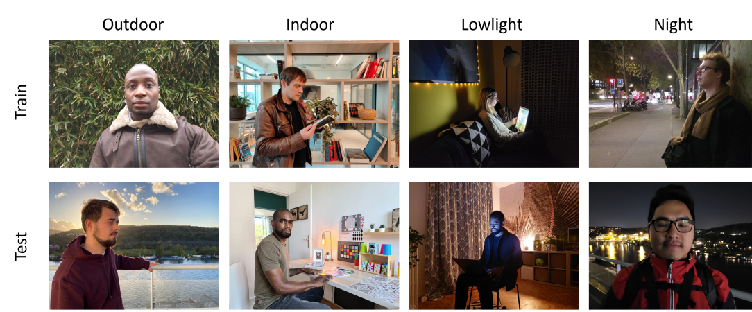
Fig. 2. Examples from the new scene split for PIQ23. The test set incorporates various framing settings, backgrounds, subject characteristics, and weather conditions that are significantly distinct from the training set.

Challenge, KonIQ-10k, and PaQ-2-PiQ datasets, respectively. For all HyperIQA variants, only the Resnet50 backbone was pre-trained on ImageNet without any subsequent IQA pre-training. Due to HyperIQA’s input size constraint of 224x224, we had to modify its architecture to handle resolutions that are multiples of 224 to be able to train on larger images.