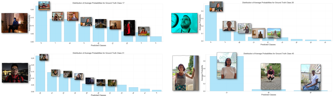
Fig. 4. Histograms showing the classification distribution across training scenes for various unseen testing conditions. The same testing scene can be projected to multiple training scenes with similar features, showcasing the necessity to consider multiple scenes for inference on new conditions.

the significance of semantic discovery when generalizing an IQA measure for unseen content. For instance, scene 17 depicts a man at his computer desk in a lowlight setting. The model projects this scene onto related contexts like desk scenes, library settings, and other lowlight scenarios. FHIQA leverages these diverse classification distributions to derive a quality assessment that integrates various content perspectives, rather than restricting itself to a singular scene or content. This approach recognizes the pivotal role of scene semantics in determining image quality. The model’s robust performance across all attributes — particularly its standout results on “Overall” — points to the need for future IQA models to offer content-specific evaluations that are both precise and nuanced.