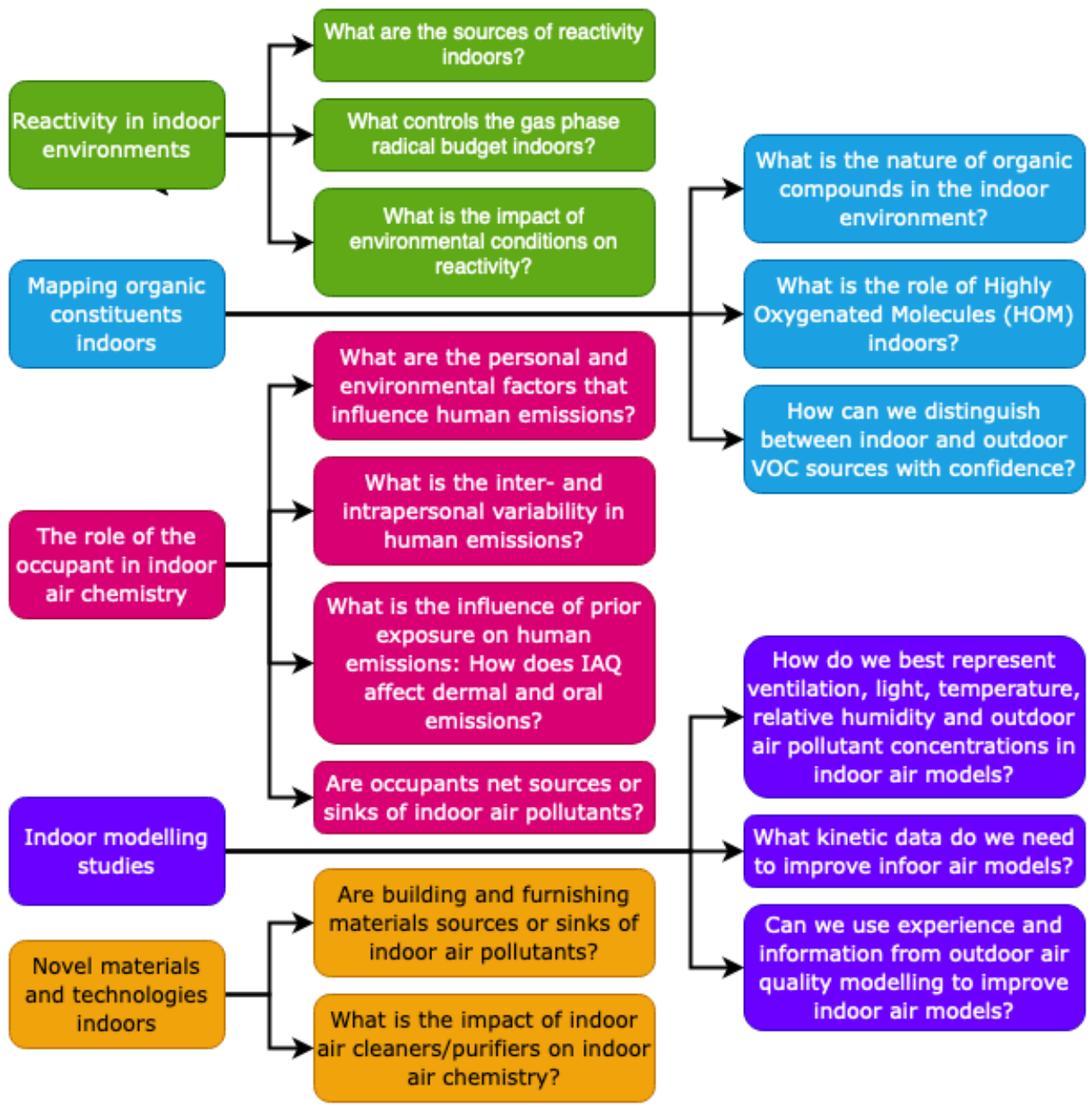
Figure 2: The conceptualised framework, showing the main research areas and specific research objectives within each.

The conceptualised framework has been used to form the basis of a Decision Tool, which can be accessed on our website [43]. The Decision Tool aims to provide advice to the community on how the specific objectives identified in Figure 2 could be addressed through measurements. For each of these 15 objectives that have been identified, the following questions are addressed: