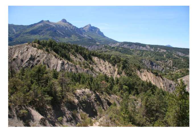
Fig. 3. Monospecific planted forest for flood and erosion control in the French Southern Alps.

mitigating natural hazards linked to gravity. For instance, forests act as natural barriers against rockfalls. Trees contribute to stop some of the falling blocks in a way similar to civil engineering structures (i.e. nets or embankments). We called this first effect the "barrier effect" (Fig. 2). Moreover, each impact on a tree contributes to a reduction of the energy of the falling rock. Therefore, rock energies observed on forested slopes are generally lower than on open slopes. We called this second effect the " buffer effect » [26]. These two effects increase with the length of the forest along the slope.