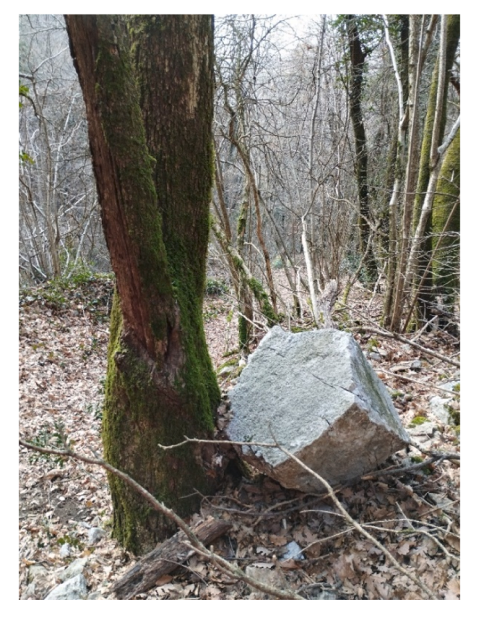
Fig. 2. Trees contribute to stop some of the falling rocks.