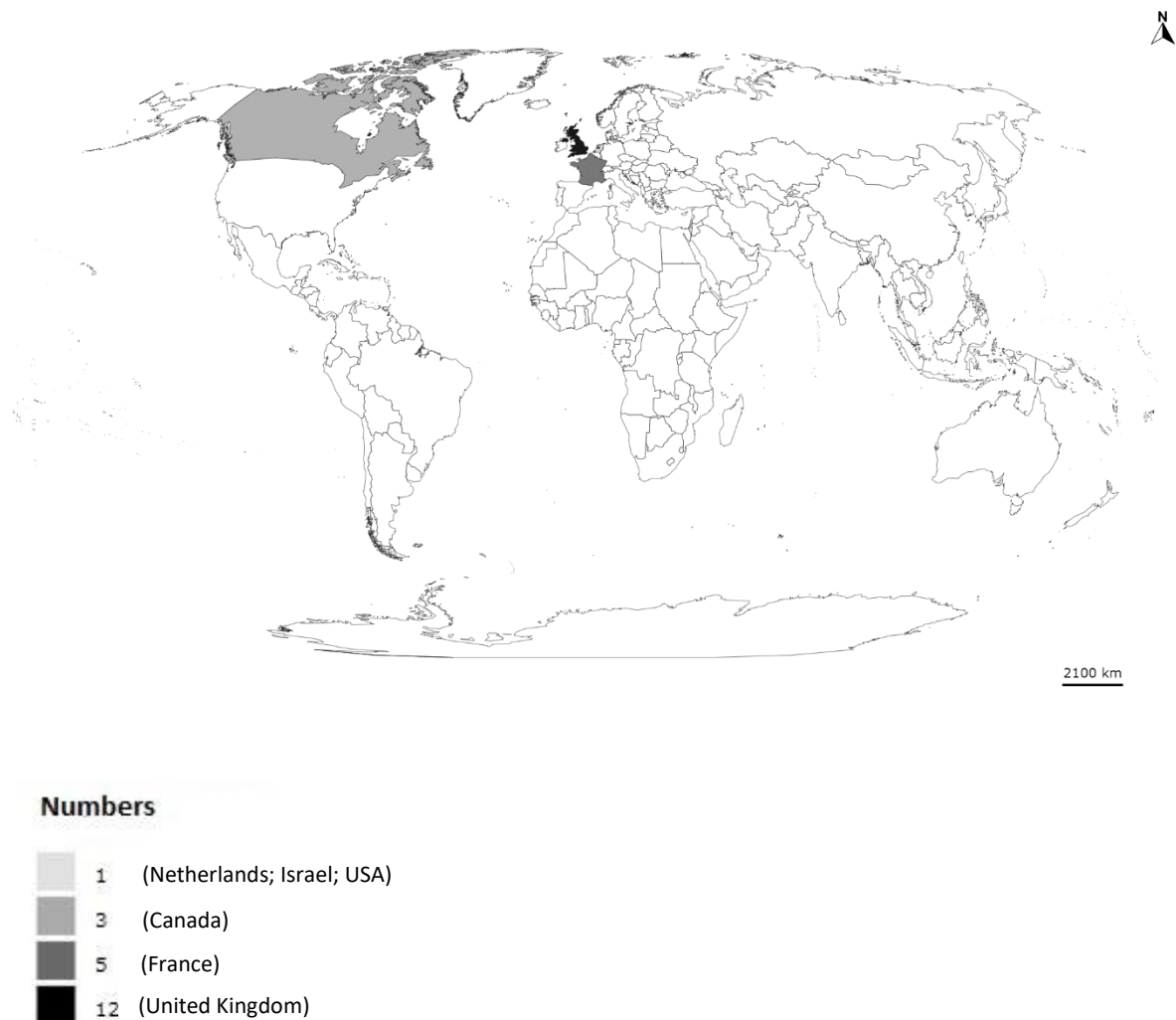
Figure 3. Geographical distribution of selected case studies

income country. Two references investigating the work of consulting firms with international organizations are not included on the map (Momani, 2017; Tchiombiano, 2019).