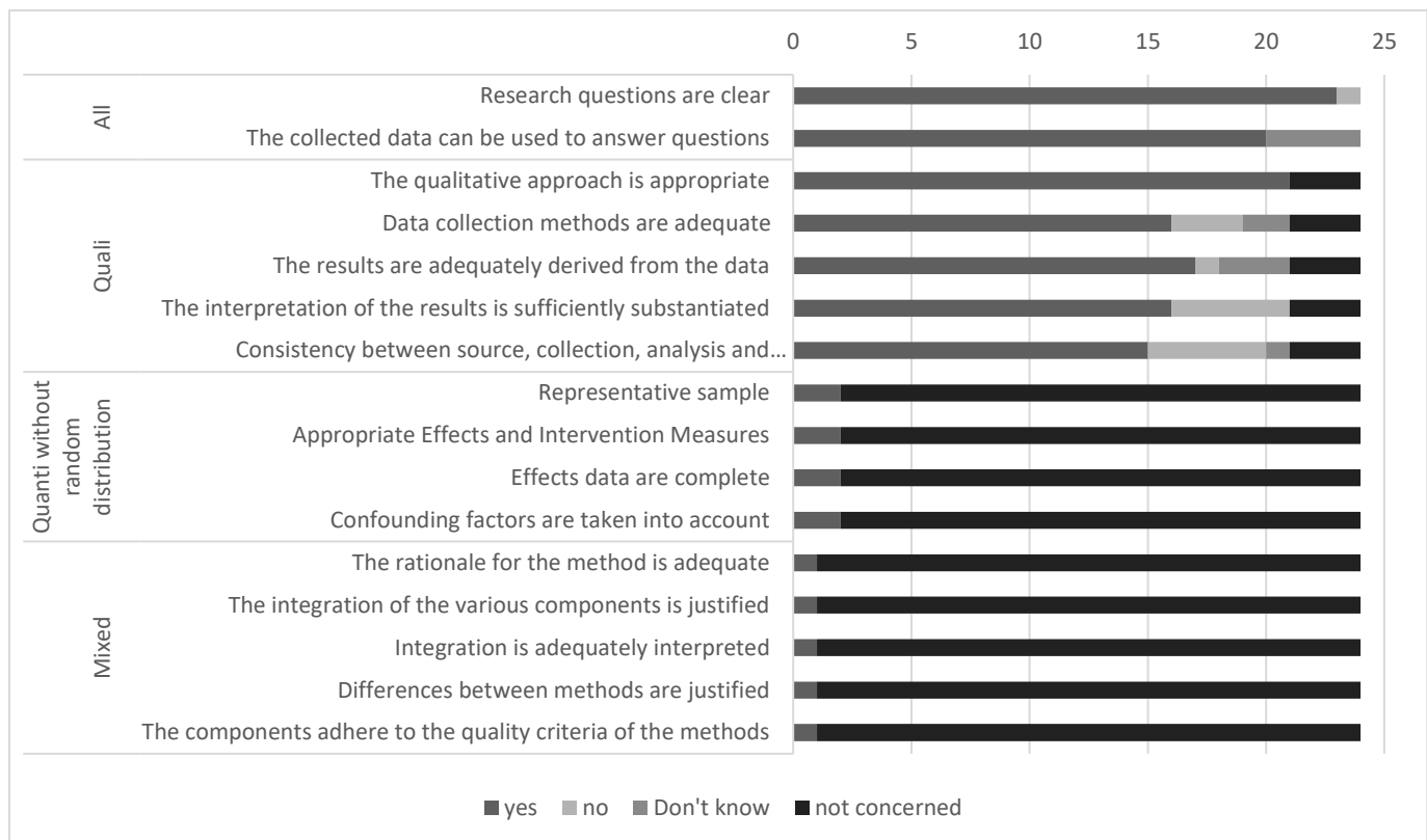
Figure 4. Quality appraisal of the selected studies' methods

The selected studies had some limitations. In particular, the MMAT tool (Figure 4) identified a lack of transparency on the methods (n = 4).