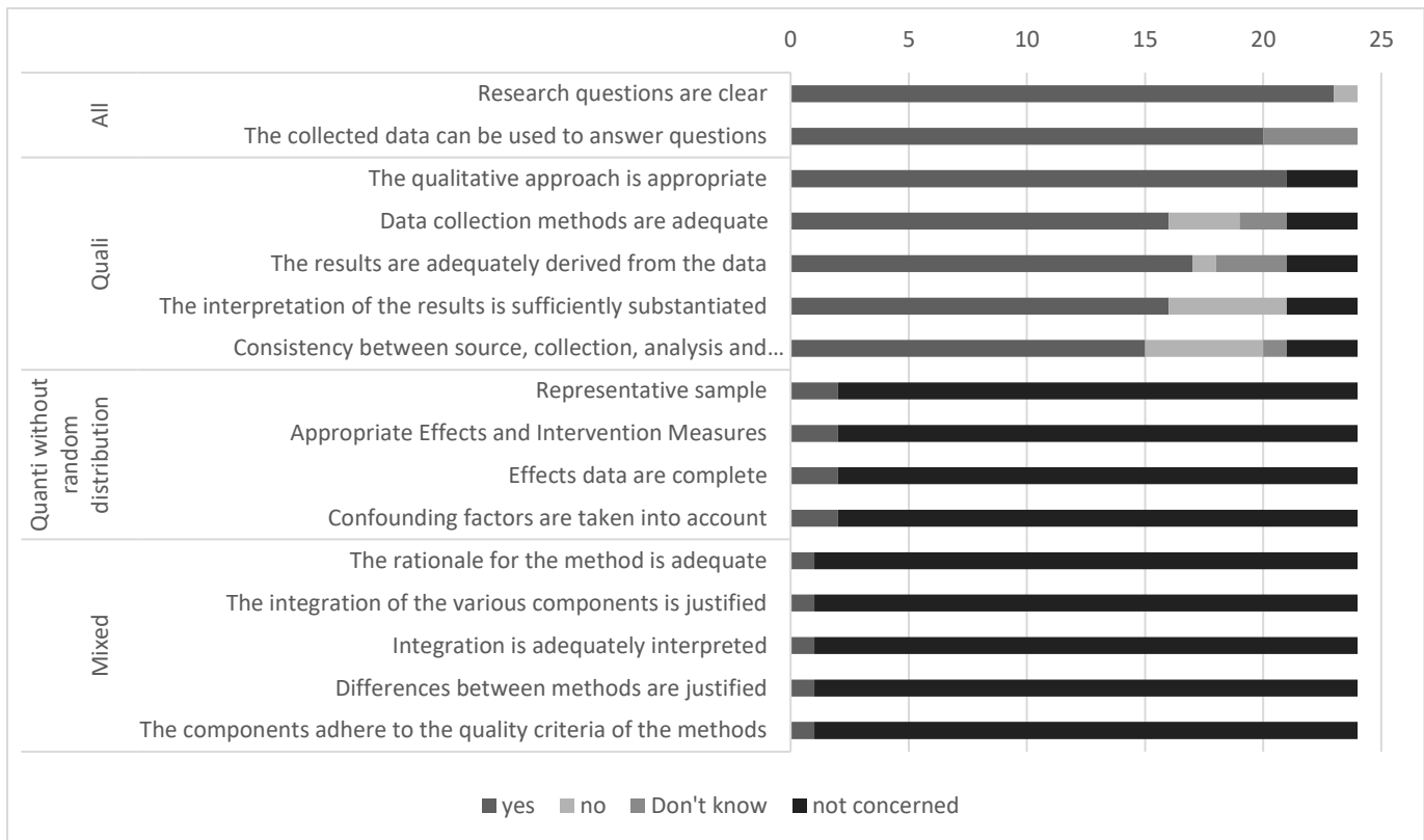
Figure 4. Quality appraisal of the selected studies' methods

The selected studies had some limitations. In particular, the MMAT tool (Figure 4) identified a lack of transparency on the methods (n = 4).