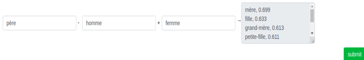
Figure 1: Example of word analogy using the analogy tool in our web app (with fr_w2v_web_w20).