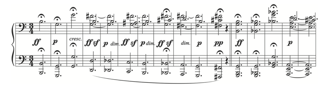
Figure 1: M. Musorgsky. Pictures at an Exhibition. 'Catacombae', m. 1–7. St. Petersburg: Bessel, 1874.

Beyond the representation of a picture made by Hartmann after a visit to Paris catacombs, this striking piece deals with the expression of death. (p. 486)