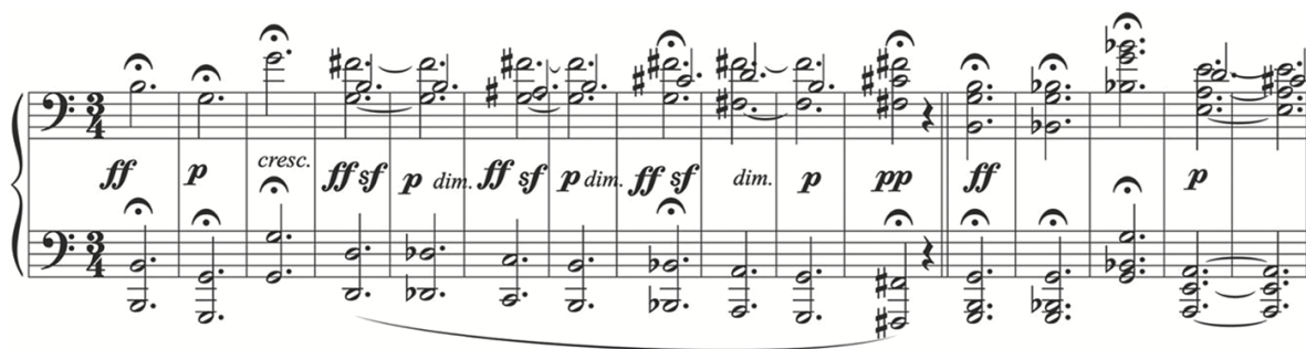
Figure 1: M. Musorgsky. Pictures at an Exhibition . 'Catacombae', m. 1–7. St. Petersburg: Bessel, 1874.

Beyond the representation of a picture made by Hartmann after a visit to Paris catacombs, this striking piece deals with the expression of death. (p. 486)