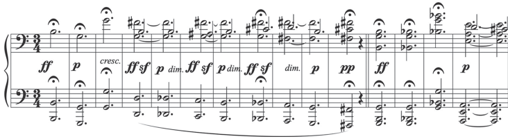
Figure 1: M. Musorgsky. Pictures at an Exhibition . ‘Catacombae’, m. 1–7. St. Petersburg: Bessel, 1874.