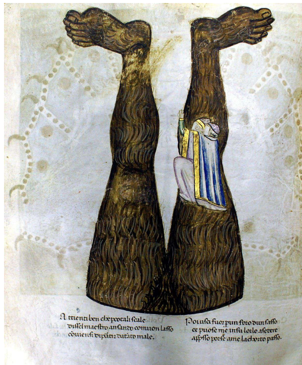
Figure 2: Lucifer upside down. Codex Altonensis Dante, Commedia , 14th c., Bibliotheca Gimnasii Altonani, Hamburg.

kingdom of darkness. During all the time of their descent, the heads of the two poets are directed towards their place of departure, that is, upwards, and their feet are directed towards the center of the Earth. But when they find themselves near Lucifer, they see him with his head down. It is also conceivable that Lucifer is standing up on his feet, and that they are themselves turned upside down, with their heads towards the bottom of the Earth and their feet towards the opposite side. We have reproduced in Figure 2 a 14 th century representation of Lucifer and one of the the two poets, upside down with respect to each other.