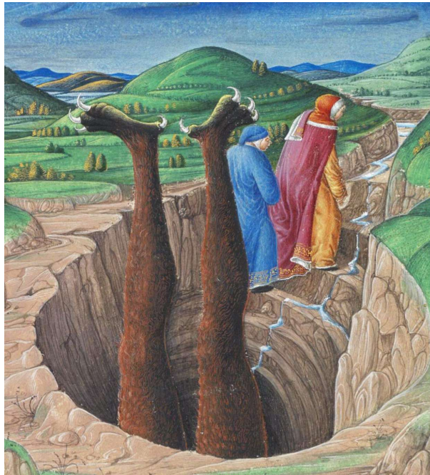
Figure 3: Illustration of canto XXXIV of Dante’s Inferno , with Lucifer upside down, and the two poets as they return to the clear world. From a manuscript in Rome, Vatican Library, Ms Urb. Lat. 365, fol. 95v. Ferrara, 1474-1482.

“Rise up,” the Master said, “upon thy feet; The way is long, and difficult the road, And now the sun to middle-tierce returns.”