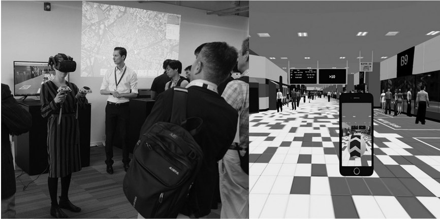
Figure 1.5 VR-supported product presentation of future guidance systems at transit hubs of autonomous public transport systems (e.g., via AR supported guidance).