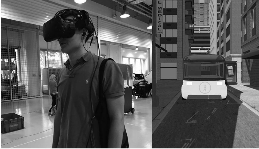
Figure 1.4 Usability testing in VR to evaluate explicit human-machine interfaces as communication cues for pedestrians when crossing a road in front of autonomous vehicles.