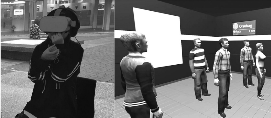
Figure 1.2 VR experience to create empathy with people at public waiting spaces in terms of room configurations, crowd, interior, and lighting.

The results show the benefits in terms of increased focus on the task as well as providing a relaxing digital environment in which ideas could be freely expressed, which had a positive impact on idea generation. Rieuf and Bouchard (2017) developed a tool for designers for creative drawing and developing mood boards in VR, two essential activities during the define phase of the design process. The researchers' findings imply that VR can enhance the emotional component of design activities and can lead to increased engagement of the involved designers. This includes the benefits associated with VR, such as experiencing 3D models and sketches in realistic scales and the ability to experience concepts from different and enhanced perspectives, as well as intuitive and natural interaction with digital content. These findings confirm the conclusions of Keeley (2018), who studied sketching activities in VR. The researcher inferred that VR allows for a greater sense of scales and perspectives.