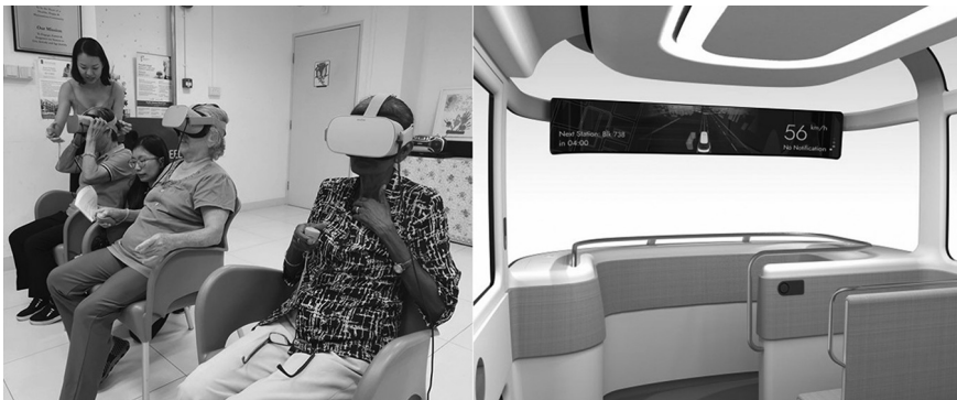
Figure 1.3 Participatory design activities in VR to define user needs for providing information of autonomous vehicles to passengers (e.g., route, velocity, and system confidence).

VR has been utilized in the develop stage for immersive prototyping and also evaluative activities such as usability testing. Especially in the area of hardware prototyping, VR is already being used to complement and ideally even replace traditional CAD applications such as Rhinoceros 2 and 3ds Max, 3 and research in this field is active to tighten the links between CAD and VR (e.g., Danglade and Guillet, 2022). Many researchers have already investigated the impact of VR and CAD within the design process (e.g., Akca, 2017; Stadler et al., 2020b). Research suggests that the main advantages are visualization and experience of realistic scales, realistic environments, engagement, and immersion. The major disadvantages of VR in this context are the lack of accuracy in developing high-fidelity prototypes, the lack of haptic feedback, and the limited field of view (FOV) for users while being immersed in VR (Stadler et al., 2020b). By comparing commercially