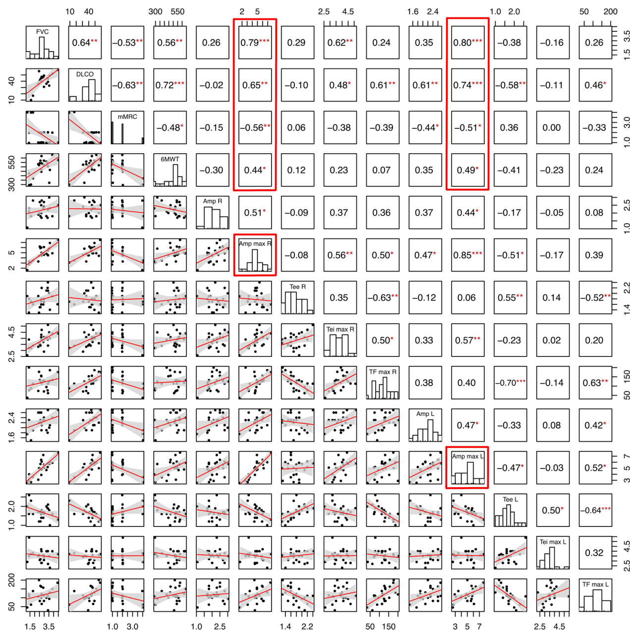
Fig. 1 Pearson correlation matrix between FVC, DLCO, dyspnea evaluated with the mMRC scale, 6MWT and diaphragmatic ultrasound parameters in IPF patients. Amp amplitude, Tee end-expiratory thickness, Tei end-inspiratory thickness, TF thickening fraction