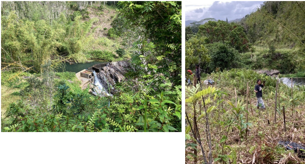
Figure 2: Haccinem water catchment.

The Northern Province implemented a reforestation project with a focus on freshwater in Touho in conjunction with the Kokingone, Tiwae, Vieux-Touho and Poyes tribes. The Northern Province started to take an interest in the problem of drinking water in 2010-2011 when they launched the first water catchment restoration project. The Province, in partnership with research institutions, identified fires and wild animals (deer and wild pigs) as two threats to the freshwater supply. Both deplete the soil by diminishing the root mass that retain water during floods. Fewer roots channelling water into groundwater tables makes the creeks, springs and rivers dry up faster during droughts as there are less water reserves (Tramier, 2021). In order to compensate for this effect, the Province suggested the reforestation of catchment areas (Figure 2) in order to protect them. It started at the provincial level with the Gohapin tribe, linked to the presence of the NGO WWF that was working in the area (Toussaint, 2018). The idea was to support the local actors and tribes in the preservation of their water catchment. After the work in Gohapin, they soon moved on to Bakuna in Hienghène, responding to concerns raised by that tribe related to its drinking water supply.