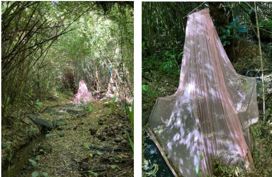
Figure 1: Uniin's spring.

get closer, I realise that Uniin's has hung a pink mosquito net around the spring to protect it. He lifts it to show me water from the spring coming directly out of a stone and forming a little stream. He had protected the creek with a thicker black net on the ground. Before, he tells me, his ancestors used coconut leaves, but a net is more durable. The water streams down the no longer used old water catchment chambers into the old cast iron pipes. In some areas where the iron has broken, he's replaced it with PVC or polyethylene pipes. White roots wave in the water, Irène tells me that bacteria in the roots filter the water by eating the little bits of sediment. Uniin tells us that the spring is guarded by a red eel who cleans it in the afternoon, while he and his wife clean the spring in the morning. They have seen the eel on multiple occasions. He warns us that you should never catch it, but leave it in the spring. Otherwise, the spring will dry up. In the morning, he explains that they remove the leaves floating on the surface, replace the stones and check the net. In the afternoon, the red eel swims along the bottom part, eating the small amount of dirt that has accumulated. (Notebook extract, July 2022, Olga Peytavi)