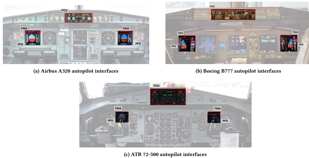
Fig. 1. Autopilot interfaces on commercial aircraft physically separate control (FCU) and feedback (FMA).