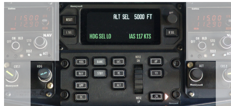
(b) ATR 72-500 FCU