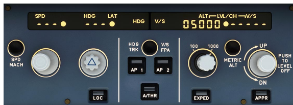
(a) A320 FCU

None of the three cockpits proposes To3 Haptic Feedback .