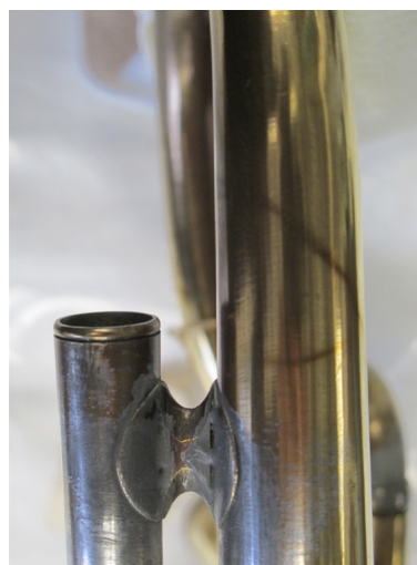
Figure 6. Brass corrosion due to a hemp thread on a trumpet (E.734)