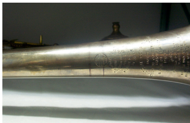
Figure 5. Silver corrosion due to a Nacrylan thread

of use (producers of sound) and art objects (Barclay 2004). During remodelling work at the museum, all of the brass instruments (which are in fact instruments made of brass or silver- or gold-plated brass such as trumpets, saxophones and trombones) were removed from their mounts to be cleaned (Loeper-Attia 2007). It was then realised that a large number of the instruments were scratched and/or corroded where they touched the supporting threads. This damage was only visible on the metal objects; other instruments made from organic materials showed no sign of oxidation. Instruments with labels attached by old thread, as could be seen, also presented surface corrosion (Figures 5–7).