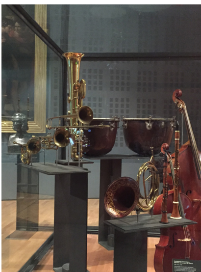
Figure 2. Display case for 19th-century instruments

In 1978, with the founding of the Cité de la musique, the decision was made to hand the Conservatoire's national collections over to the state, leading to the creation of the Musée de la musique in 1995. An acquisition and