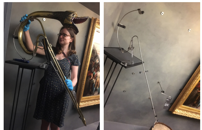
Figures 3 and 4. Instrument mounting in a display case

The mounts created for the museum when it opened in 1997 were designed by architect Frank Hammoutène. Today, the museum is still required and obliged to use the same type of mount, based on the principle that the instruments are (generally) presented vertically or in playing position. A metal armature holds them up with half-rings covered in high-density polyethylene foam and threads encircling the instrument. These museographical constraints were included in the convention signed between Frank Hammoutène and the Musée de la musique. It explains why this display method is imperative and why it must continue to be used even today. Securing the instrument in a vertical position requires adjusted grips and a mounting perfectly adapted to the instrument. This often requires fastidious adjustments (Figures 3 and 4). There were, however, several exceptions to this rule when an instrument's configuration was particularly unusual and could not be made to fit the mounts designed by Frank Hammoutène.