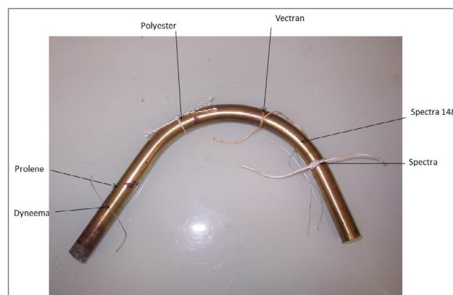
Figure 8. Brass tube with different threads

were created, i.e. thread and metal in direct contact, since the damage observed was only the result of direct contact and not a gaseous effect. The metal support chosen was a form of brass, similar to the alloys found in brass instruments, i.e. with a mass percentage of around 30% zinc. This content is close to that of alloys now referred to as 'cartridge brass', characterised by better ductility and higher corrosion resistance. Indeed, brasses containing up to 35% zinc are single-phase and reputed for their ductility and malleability when cold. Above 35%, hardness increases and ductility when cold is not as good, although malleability when hot is excellent. The maximum threshold for zinc content in brass is 42%, beyond which the alloys become too fragile. Two tubes and a rectangular-section rod were cleaned with abrasive powder (calcium carbonate), then rinsed and degreased with demineralised water, ethanol, acetone and cyclohexane. Various threads were then knotted to this assembly as shown on one of the tubes (Figure 8).