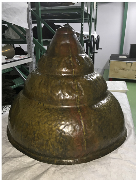
Figure 4. Sax's bell (E.974.11.22)