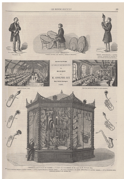
Figure 3. Sax's workshop ( Le Monde Illustré , 3 January 1863, p. 13)

bath of metal salts, to which a weak electric current is applied. The anode is a plate of pure metal and the cathode consists of the pieces to be plated.