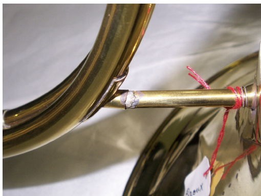
Figure 6. Unsuccessful re-soldering