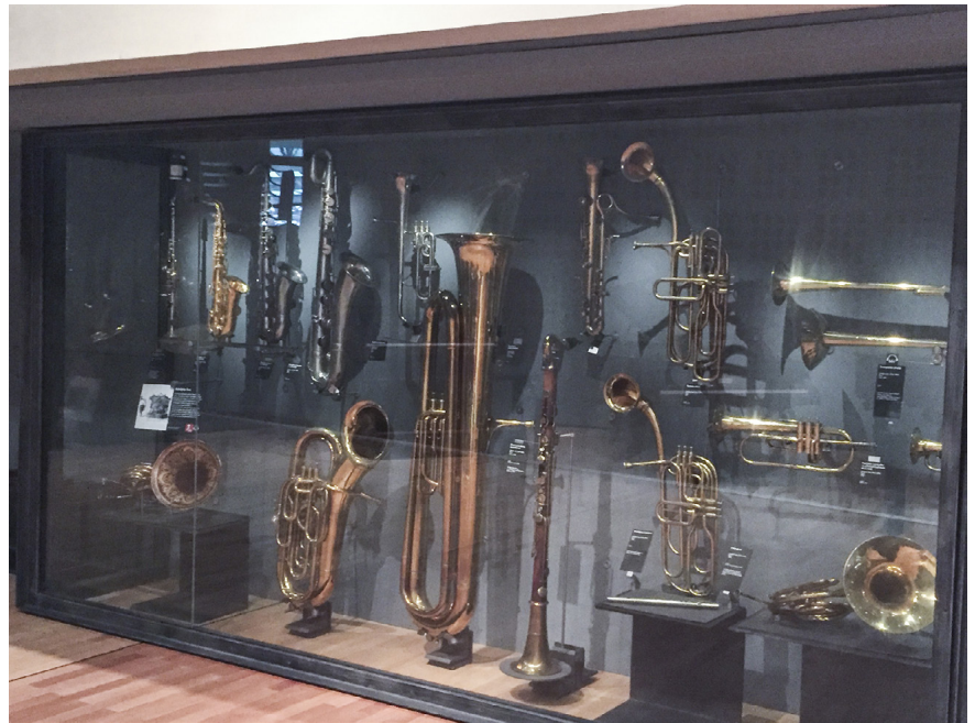
Figure 1. The showcase for Sax's instruments at the Musée de la musique

current building (1992–97); during its renovation in 2009; in preparation for significant loans, such as those to the SAX200 exhibition (co-organized by the Musée) and to the Museum of Musical Instruments, Brussels (mim) in 2014; and for museum recording projects (Figure 1).