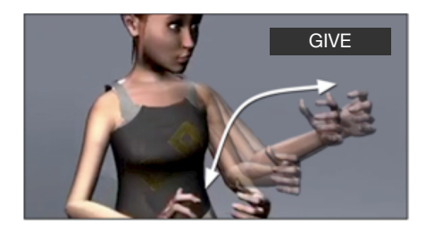
Fig. 2. In the sentence "I give you a glass", the hand movement follows a line, starting from an area near the body (pronoun [I]) and ending in front of the signer (pronoun [YOU]). In the sentence "You give me a glass", the starting and ending points are reversed

Indicating verbs correspond to signs that are inflected according to the agent/recipient relationship. The trajectory of the hand thus changes according to the agent (subject of the verb) and the recipient of the action. For example, the verb [GIVE] can be inflected according to different trajectories whose starting and ending points determine the pronouns representing the agent or the beneficiary. This is illustrated in Fig. 2. In the sentence "I'll give you a drink": the hand trajectory is a line that starts near the