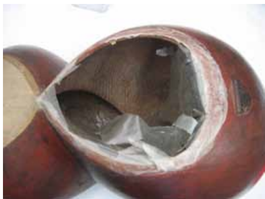
Fig. 9. Skin of the lute before reinforcement.