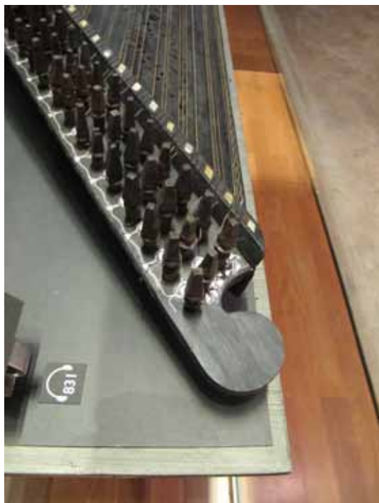
Fig. 8. Zither on table, Qanun, E.1358, Damas, 18th century, acquired in 1889, Musée de la musique. Reintegration of the missing part of the zither (terminal part) with stained balsa wood.