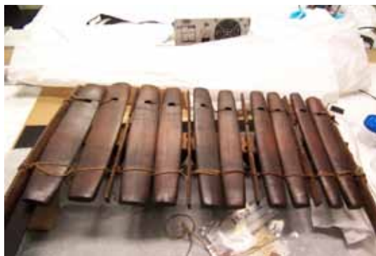
Fig. 3. Bala xylophone, E.386, Senegal, 19th century. Musée de la musique. Xylophone after cleaning of the surface with artificial saliva.