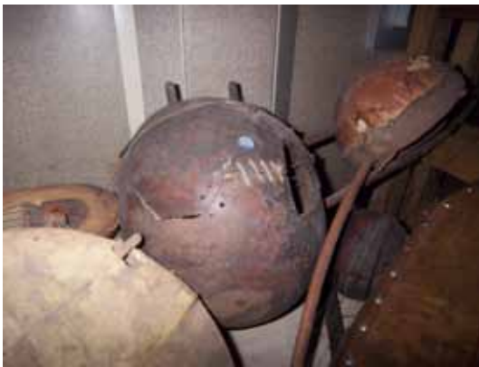
Fig. 1. Reinforcement of the broken gourd with plant fibres.

It is important to know the original characteristics of an instrument and detect