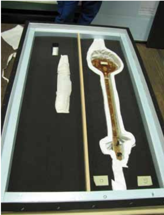
Fig. 6. Storage of an Asian instrument in polyethylene and fabric (Tyvek), storage room of the Musée de la musique.

spanning the gamut from practically zero intervention to making the object entirely functional. In this case, several criteria can be used to define the level of intervention: