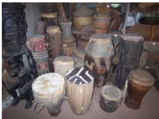
Fig. 5. Different drums using various skins and wood types in the storage rooms of the Théodor Monod museum in Dakar (Senegal).

signs of successive modification phases, quite simply because the end condition of an instrument may well bear witness to its cultural rather than its musical history. As an example, the various layers of deposits on this xylophone (Fig. 3) could correspond either to maintenance phases (oil layer) or to external pollutants (soot, dust, concrete powder). Conservators had to identify each of these individual layers before setting to work. The inscription that can be seen on the skin of this Banza refers to how it was collected by Victor Schoelcher; in other words, it is a reference to a post-usage history (Fig. 4).