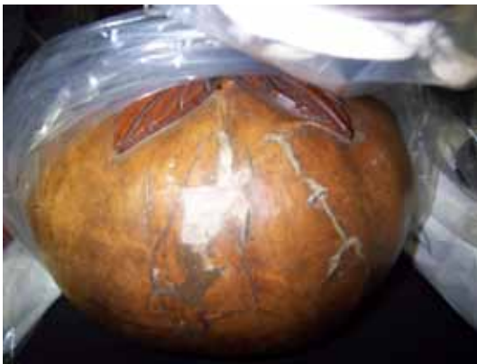
Fig. 2. Reinforcement of the crack in the gourd with metal threads.