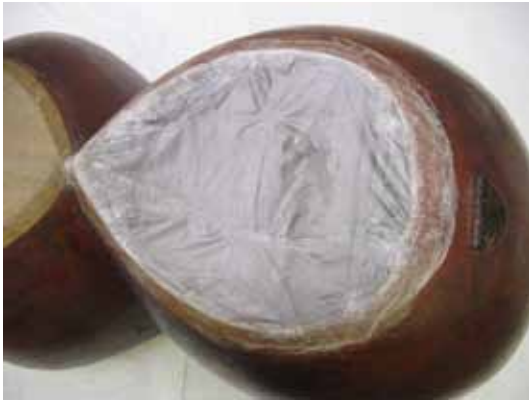
Fig. 11. Skin of the lute after repair and reinforcement.