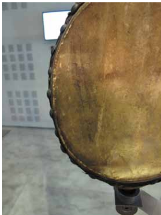
Fig. 4. Banza lute, E.415, Haïti, before 1841. Gift of M. V. Schoelcher, Musée de la musique. Handwritten inscription on the skin of the lute.