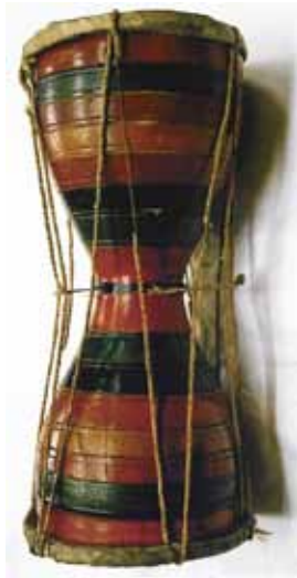
Fig. 12. Reintegration of the fibres of a Hurruk (Musée de la musique) with synthetic fibres.