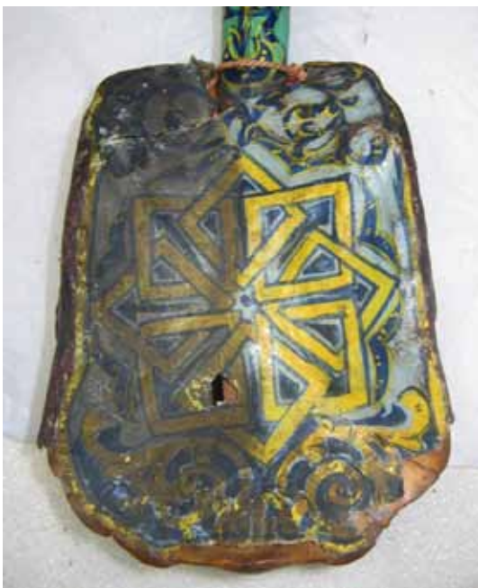
Fig. 7. Guinbri lute E.2274, Algeria, 19th century. Gift of Henri Cesbron in 1934, Musée de la musique. Dry cleaning of the painted surface of the lute.

This consists in learning how to safely handle these instruments. For example, gloves are mandatory to avoid contact between human hands and parts of the instrument covered with wood varnish or powder coating. The tension of the strings is checked so as to never store an instrument with excessively tight strings, which would necessarily lead to destructive stresses in these highly reactive materials that are skin, wood, and leather. The extent to which the strings are loosened depends on the required reduction in instrument fatigue. The various assembly modes, such as nesting, stapling, and connectors must also be correctly assessed prior to handling, thus making it possible to maintain all the moving elements of the instrument. For example, an instrument should never be handled solely by the handle, but also by the body.