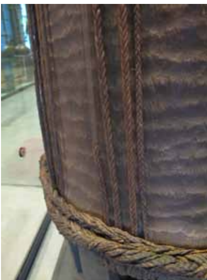
Fig. 13. Cylindrical drum, E.319, Tahiti, before 1843, gift of M. L. Clapissou in 1864, Musée de la musique. Reinforcement and reintegration of fibres with dyed silk crepe line on the drum E.319.

The overwhelming majority of adhesives used, both natural and synthetic, are reversible, such as DMC 4 , Klucel G 5 or Paraloid 6 resin (Fig. 8)