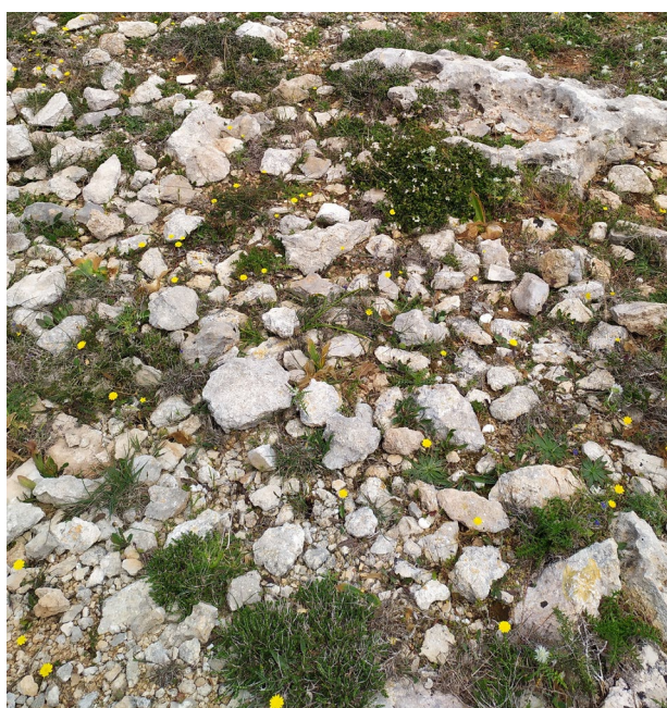
Figure 1. General habitat in which bees were encountered constructing nests – coastal karstic garigue with rocky exposed ground, shallow soil and low-lying aromatic shrubs.

This species is a widely distributed one, occurring in West, East (including North Caucasus and Crimea) and South Europe, much of the Middle East, Central Asia and North Africa (FATERYGA et al. , 2018). Megachile parietina collects particles of soil and binds them with a labial secretion, constructing dome-shaped nests containing multiple cylindrical cells provisioned with pollen and nectar – favouring that of Fabaceae – all sealed with mud. The nests are usually built directly on exposed rock surfaces and walls but may occasionally be constructed around twigs and branches (REBMANN, 1969; WESTRICH, 1989; MÜLLER et al. , 1997; VEREECKEN et al. , 2010; GOGALA, 2014). In many respects, the nesting biology of M. parietina closely matches that of its consubgenus Megachile sicula (ROSSI, 1792) which is common and widespread in the Maltese Islands and occurs in the karstic coastal garigue of Pembroke (figure 1), where the specimens of M. parietina were found.