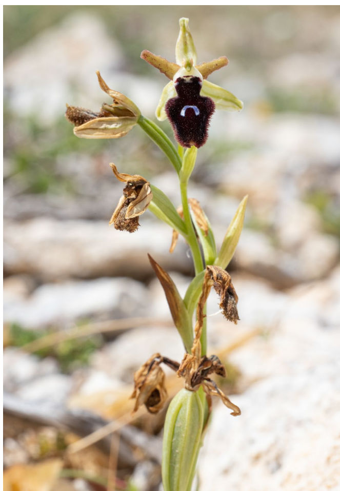
Figure 4. One of multiple Ophrys melitensis plants growing about one metre from nesting M. parietina .

It is interesting to note that in both areas in which the author observed females of M. parietina constructing nests, small populations of the endemic and scarce orchid Ophrys melitensis (SALK.) DEVILLERS-TERSCH. & DEVILLERS (figure 4) were in flower. So far, the only known pollinator of this plant is the male of Megachile ( Chalicodoma ) sicula , with pollinia being attached to the male's frons upon pseudocopulation (SALKOWSKI, 2000). The possibility that males of M. parietina could also serve well as pollinators of this orchid is not entirely excluded; M. sicula and M. parietina are closely related species (PRAZ, 2017). The author remained at the site were the second M. parietina female was completing its nest and closely observed the Ophrys melitensis flowering there for four hours (10:00 – 14:00) a day for three days (8–10 April 2023), but no males of M. parietina were seen pseudocopulating with O. melitensis . Nevertheless, the author encourages further investigation to ascertain whether this bee may be an additional pollinator of the scarce and endemic taxon O. melitensis .