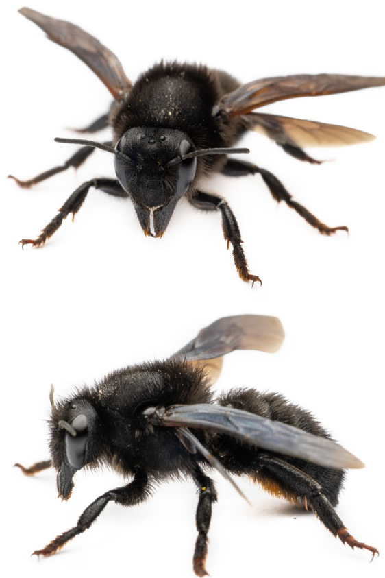
Figure 2. Megachile (Chalicodoma) parietina (Geoffroy, 1785), ♀, from Pembroke, Malta. Front view and lateral view.

Two females were encountered in Pembroke. The first, which was collected by the author (figure 2), had recently begun constructing a pedotrophic nest in a shallow depression in exposed limestone, with one cell complete and the wall of another still being constructed. The second was encountered 300 m away (coordinates: 35°55'59.1" N, 14°28'52.0" E) in the very final stages of completing an entire nest (also on exposed coralline limestone) by sealing the cells, and another two freshly completed nests were found less than one m from this activity (figure 3). This latter female was filmed by the author but not collected.