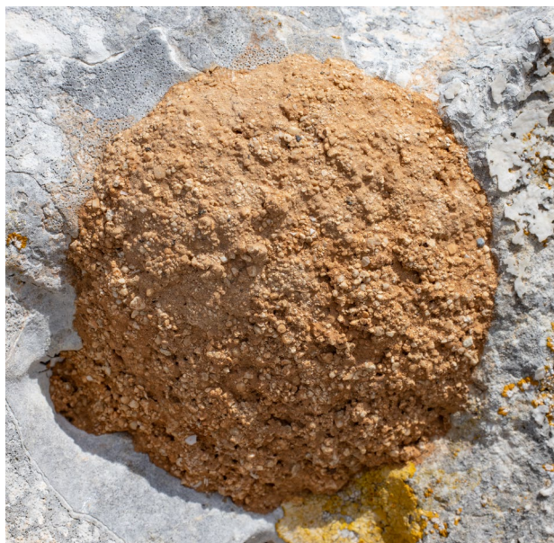
Figure 3. Completed nest of M. parietina from Pembroke, Malta.

unless particularly rare, and the possibility that it may represent an introduced species for Malta is not entirely excluded. Certainly, other hymenopterans are known to have entered the Maltese Islands (and subsequently established themselves) through the accidental transport of pedotrophic nests attached to goods, marine vessels and so on (CASSAR & MIFSUD, 2020b). However, it seems unlikely