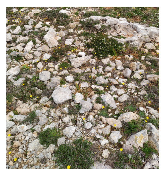
Figure 1. General habitat in which bees were encountered constructing nests – coastal karstic garigue with rocky exposed ground, shallow soil and low-lying aromatic shrubs.

This species is a widely distributed one, occurring in West, East (including North Caucasus and Crimea) and South Europe, much of the Middle East, Central Asia and North Africa (FATERYGA et al., 2018). Megachile parietina collects particles of soil and binds them with a labial secretion, constructing dome-shaped nests containing multiple cylindrical cells provisioned with pollen and nectar favouring that of Fabaceae - all sealed with mud. The nests are usually built directly on exposed rock surfaces and walls but may occasionally be constructed around twigs and branches (REBMANN, 1969; WESTRICH, 1989; MÜLLER et al., 1997; VEREECKEN et al., 2010; GOGALA, 2014). In many respects, the nesting biology of M. parietina closely matches that of its consubgener Megachile sicula (ROSSI, 1792) which is common and widespread in the Maltese Islands and occurs in the karstic coastal garigue of Pembroke (figure 1), where the specimens of M. parietina were found.