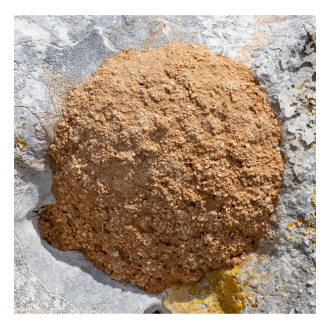
Figure 3. Completed nest of M. parietina from Pembroke, Malta.

unless particularly rare, and the possibility that it may represent an introduced species for Malta is not entirely excluded. Certainly, other hymenopterans are known to have entered the Maltese Islands (and subsequently established themselves) through the accidental transport of pedotrophic nests attached to goods, marine vessels and so on (CASSAR & MIFSUD, 2020b). However, it seems unlikely