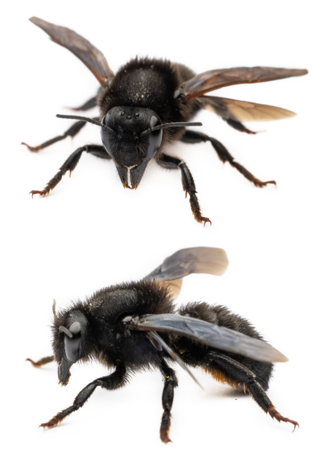
Figure 2. Megachile (Chalicodoma) parietina (Geoffroy, 1785), ♀, from Pembroke, Malta Front view and lateral view.

Two females were encountered in Pembroke. The first, which was collected by the author (figure 2), had recently begun constructing a pedotrophic nest in a shallow depression in exposed limestone, with one cell complete and the wall of another still being constructed. The second was encountered 300 m away (coordinates: 35°55'59.1" N, 14°28'52.0" E) in the very final stages of completing an entire nest (also on exposed coralline limestone) by sealing the cells, and another two freshly completed nests were found less than one m from this activity (figure 3). This latter female was filmed by the author but not collected.