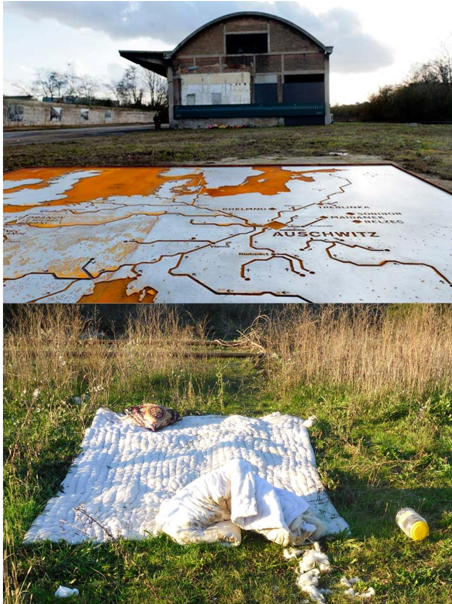
Figure 2 Mapping existing formal and informal practice on site (2013)