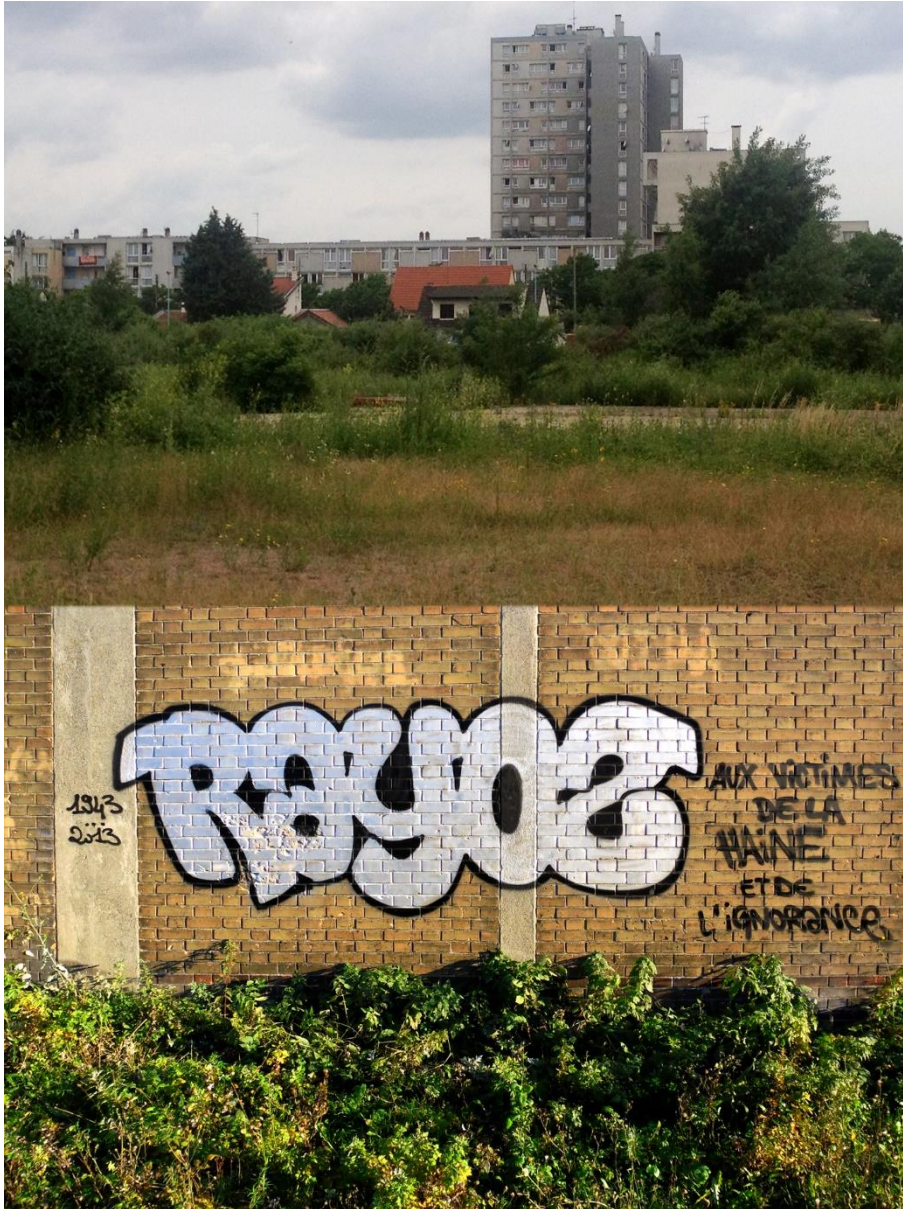
Figure 1 Mapping existing formal and informal practice on site (2013)

Traces of precarious habitat recorded on site testify that excluded populations already live there, supported informally by the city's maintenance people, with the concern to remain unnoticed (see figure 1 and 2). In conversation we also found out that the position against an opening up of the memorial site towards everyday uses is far less pervasive among memorial actors than we were told. All these observations would require an adjustment and reformulation of the project's objectives.