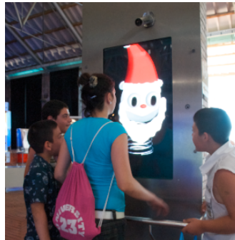
figure 1. View of the test of the application in the science museum in Naples, Italy.

Studio Azzurro Via Procaccini 4 C.O. La Fabbrica del Vapore 20154 Milano Italia stf@studioazzurro.com