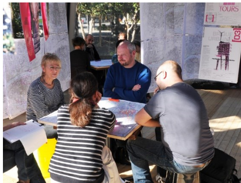
Figure 1 TabulaRosa produced PLU/PADD 2009 Tours.

TabulaRosa is played around a game board. The goal is to redesign a situation, the city, a territory, by four people together and to see what emerges from this interaction. Let us suppose that ideas pre-exist among the people within a territory. The interactive structure of the game provides the framework to bring out the peculiarities that already exist and to weave them into a common vision, a vision that remains palpable and rooted, because imagined with elements from reality and by real people. Ideas, desires, needs are brought on the table and played out in form of a polyphonic narrative. Sometimes these scenarios generate unexpected configurations and project ideas.