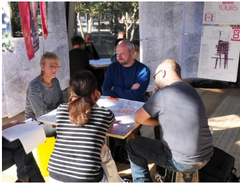
Figure 1 TabulaRosa produced PLU/PADD 2009 Tours.

TabulaRosa is played around a game board. The goal is to redesign a situation, the city, a territory, by four people together and to see what emerges from this interaction. Let us suppose that ideas pre-exist among the people within a territory. The interactive structure of the game provides the framework to bring out the peculiarities that already exist and to weave them into a common vision, a vision that remains palpable and rooted, because imagined with elements from reality and by real people. Ideas, desires, needs are brought on the table and played out in form of a polyphonic narrative. Sometimes these scenarios generate unexpected configurations and project ideas.