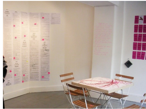
Figure 2 Game environments production FAV 2004 Paris.