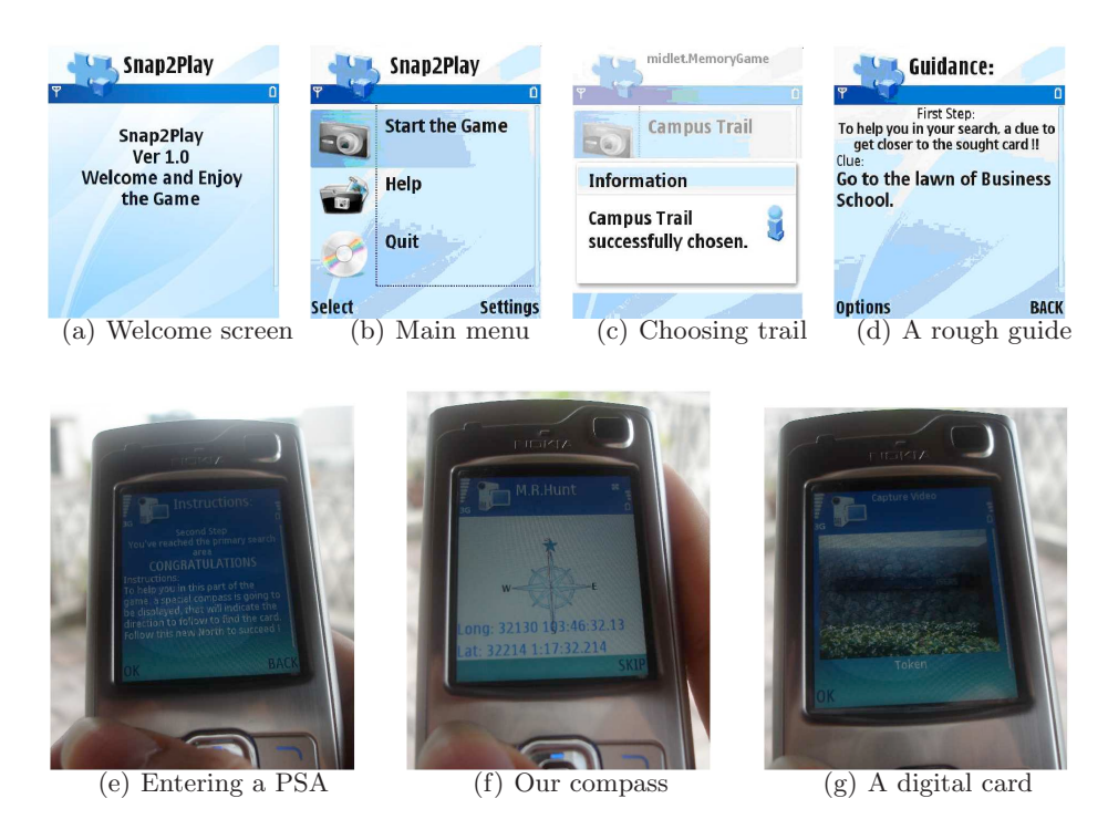
Fig. 4. Sample screen shots of the user interface on the Nokia N80 of our system.