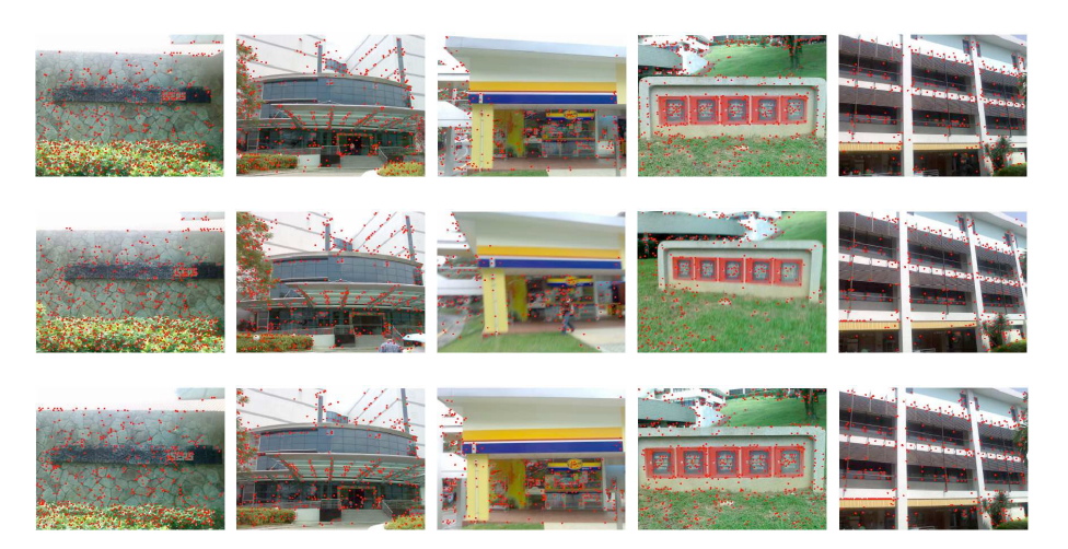
Fig. 3. Sample images of 5 physical cards in the Campus trail. Observe the variations that exist for a particular scene. Points in these images are detected SIFT keypoints.

Before training H_n , a set of sample images of the N scenes have to be collected. Ideally, the samples should be captured in a manner that includes, as much as possible, the variations expected from images taken by the players as Fig. 3 illustrates. Secondly, the type of feature to be extracted from input images \mathbf{I} on which H_n operates has to be determined. Experimental results from object and scene category classification [3–5] suggest that local features which are invariant to affine transformations are very suited for the task. In particular, the SIFT framework [7] has proven to be effective and robust against distortions caused by rotation, scaling, affine transformations and minor lighting changes. It involves two stages, namely keypoint detection and local descriptor extraction. Each descriptor is typically a 128-dimension feature vector which allows the the keypoint to be compared. Fig. 3 shows the SIFT keypoints of the sample images.