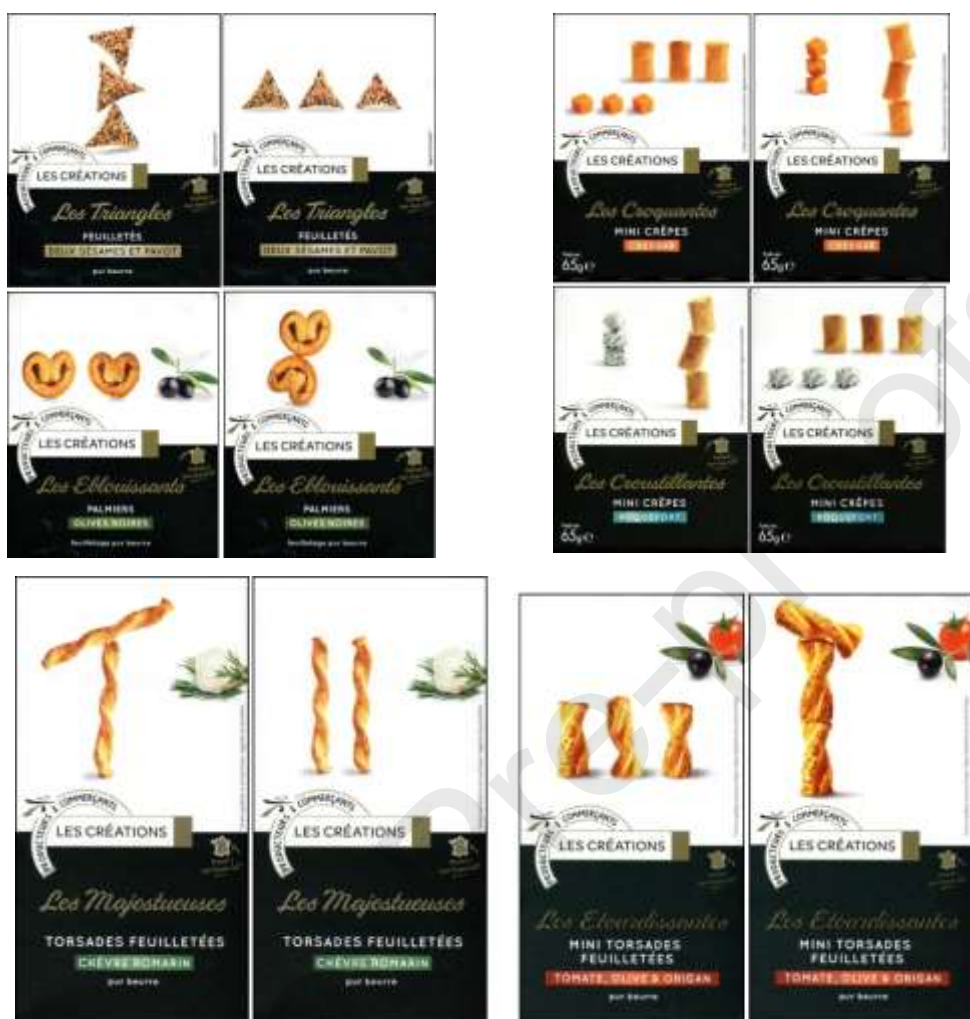
Figure 1. Target FOPs used in the experiment