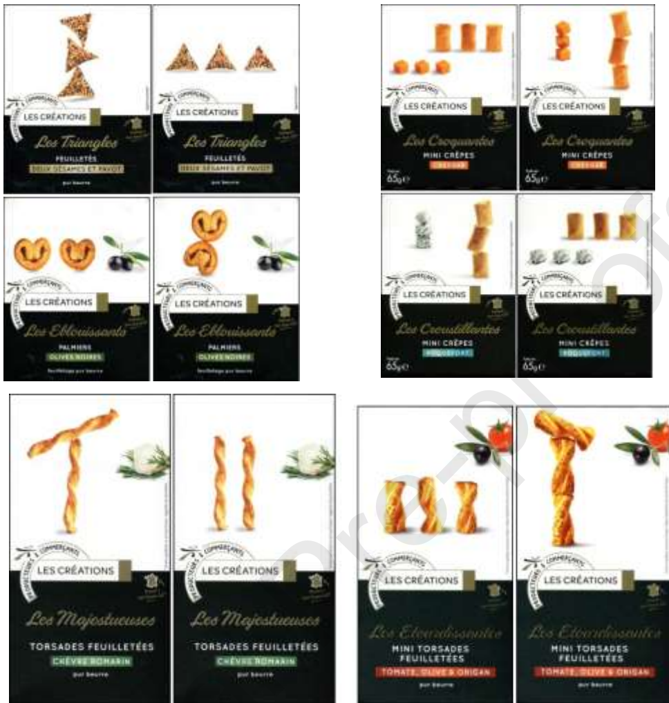
Figure 1. Target FOPs used in the experiment