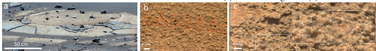
Fig. 3. a) Concentric feature at Amundsen (Mastcam-Z). b) Carbonate-rich coarse-grain soil target Toothawara (RMI). c) Rough texture of Baresand Point target at Turquoise Bay (RMI). Inset shows darker grains similar in size to the soil grains, apparently weathering out of bedrock.